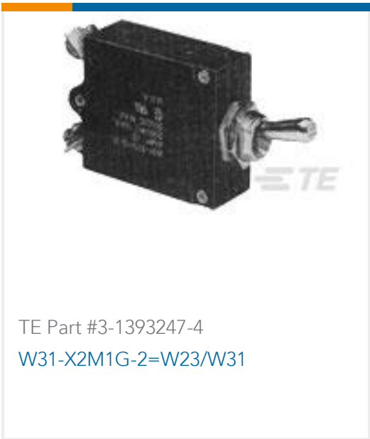
TE Part #3-1393247-4 W31-X2M1G-2=W23/W31