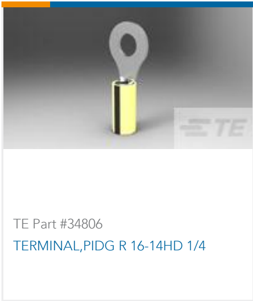
TE Part #34806 TERMINAL,PIDG R 16-14HD 1/4