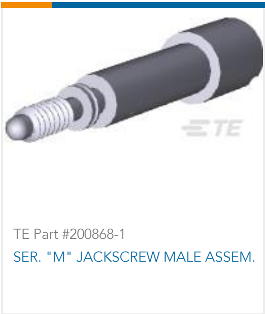
TE Part #200868-1 SER. "M" JACKSCREW MALE ASSEM.