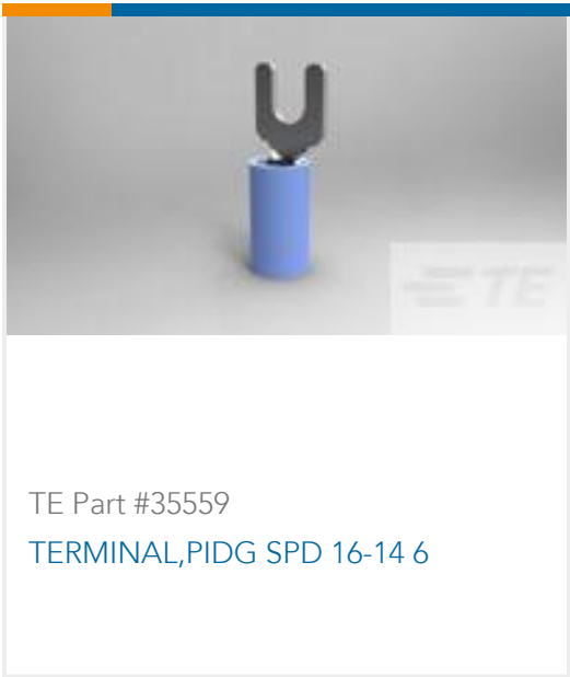
TE Part #35559 TERMINAL,PIDG SPD 16-14 6