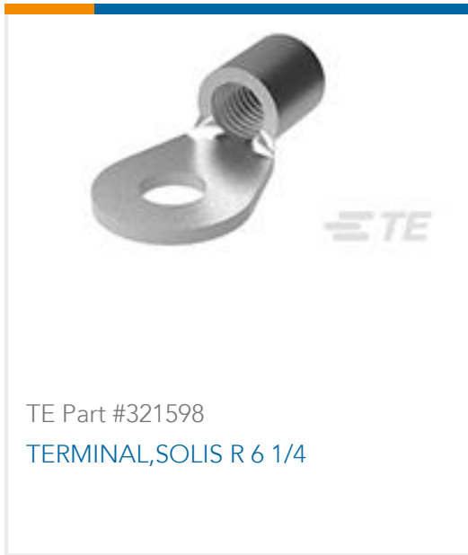
TE Part #321598 TERMINAL,SOLIS R 6 1/4