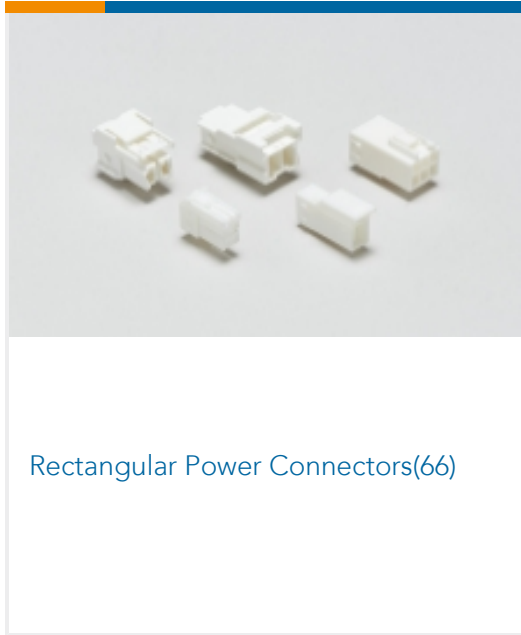
Rectangular Power Connectors(66)