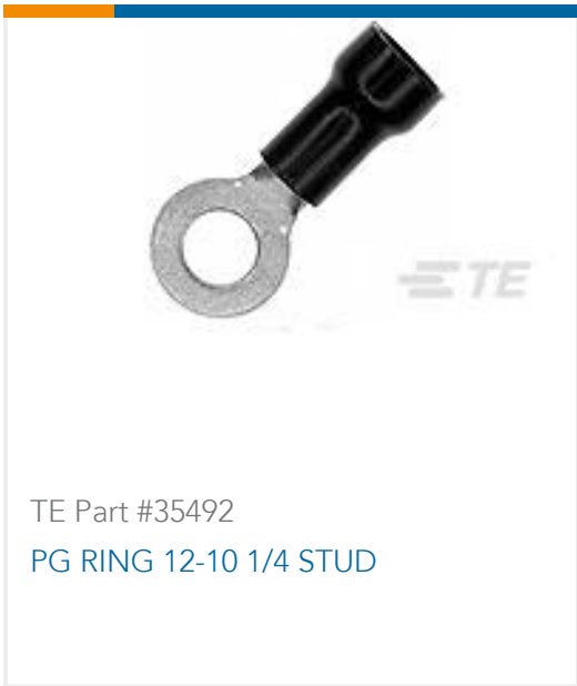
TE Part #35492 PG RING 12-10 1/4 STUD