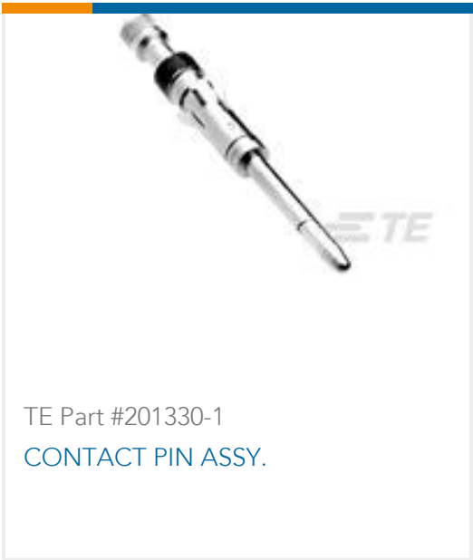
TE Part #201330-1 CONTACT PIN ASSY.