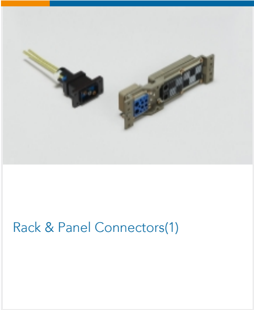
Rack & Panel Connectors(1)