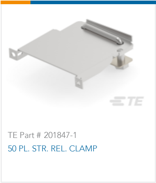
TE Part # 201847-1 50 PL. STR. REL. CLAMP