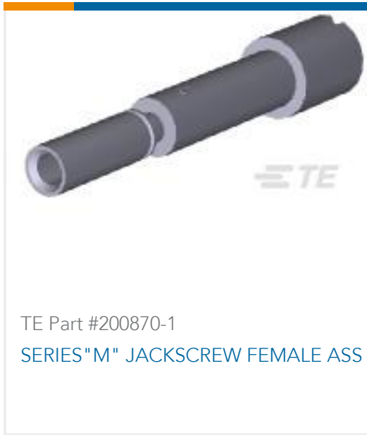
TE Part #200870-1 SERIES "M" JACKSCREW FEMALE ASS