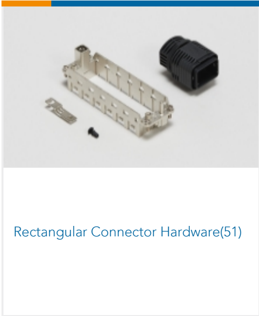
Rectangular Connector Hardware(51)