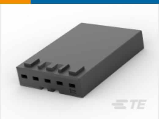
TE Part #2295894-1 SIGNAL HOUSING