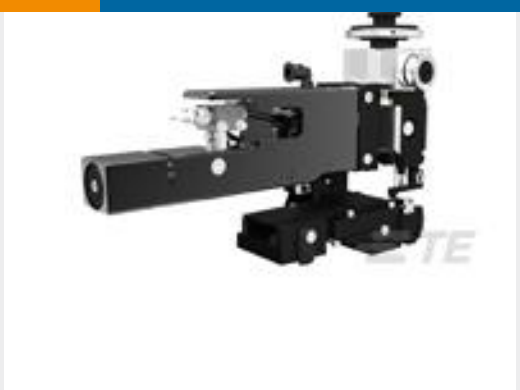
TE Part #2151338-2 OCEAN-2.0-APPLICATOR-S-140F140O2100