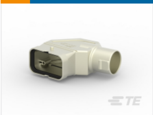
TE Part #2120330-1 METAL HOOD / KIT