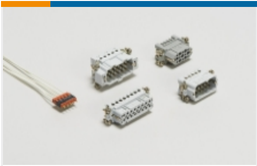
Rectangular Contact Inserts(5)