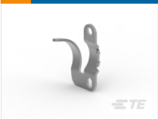
TE Part #2120338-3 SCREEN CLAMP