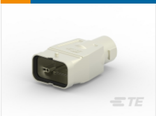
TE Part #2120457-1 HOOD KIT MOTORMAN HC 180 METAL