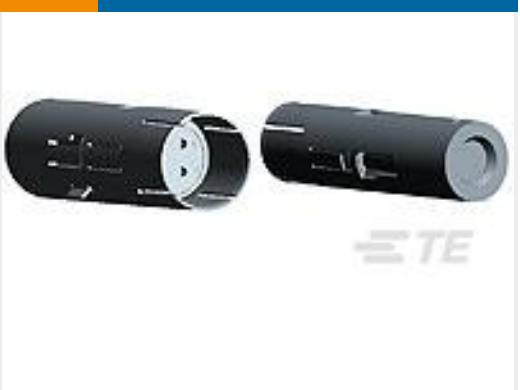
TE Part #1103426-1 MALE INSERT, CRIMP, 4-POS. 22DF CONTACTS