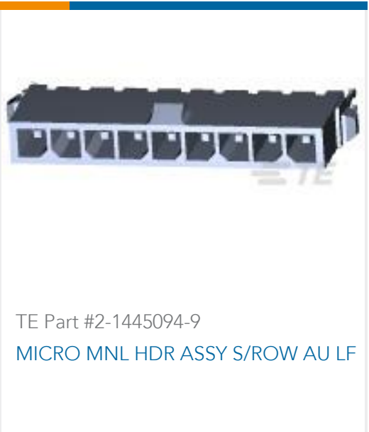
TE Part #2-1445094-9 MICRO MNL HDR ASSY S/ROW AU LF