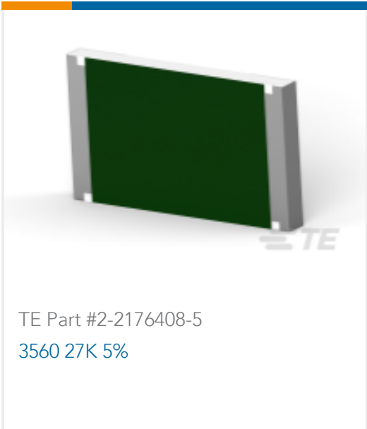
TE Part #2-2176408-5 3560 27K 5%