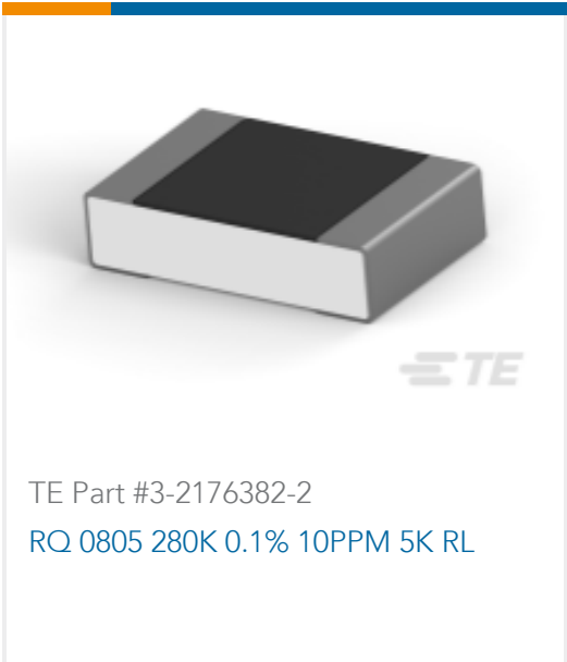
TE Part #3-2176382-2 RQ 0805 280K 0.1% 10PPM 5K RL