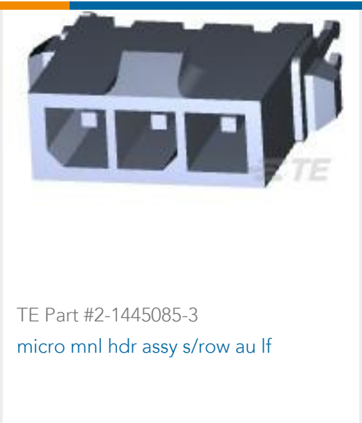
TE Part #2-1445085-3 micro mnl hdr assy s/row au lf