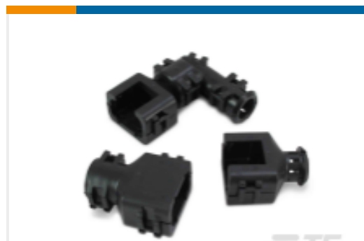
TE Part #2292802-1 AMPSEAL 16 Connectors Backshell