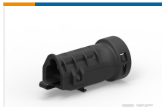
TE Part #1418917-1 MULTI CORE CABLE ADAPTER 180 DEGREE