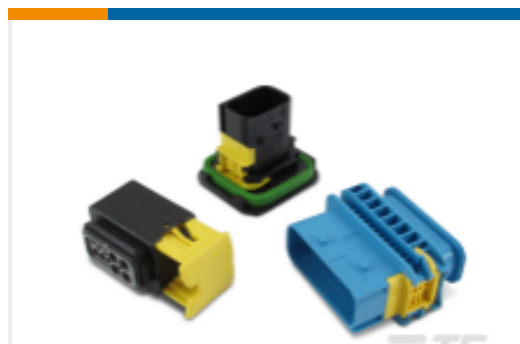
TE Part #3-1418469-1 Heavy Duty Sealed Connector Series Housings