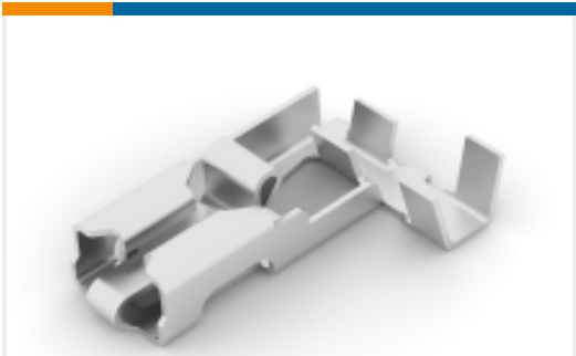
TE Part #282349-1 PL 250 FLAG REC 0.5-1.5MM2 0.4 X 44 NISI