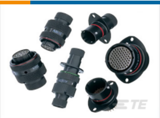
TE Part #AS212-35SA RECEPT.BOX MTG.TYPE 2