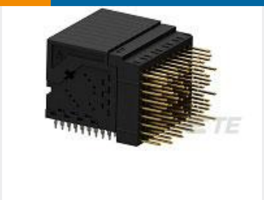
TE Part #2102436-2 FORTIS LRM, RIGHT ANGLE HEADER