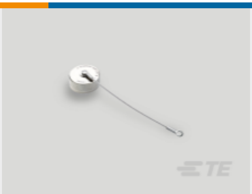
TE Part #YDTS33W11RV0010000 DUST COVER ASSEM