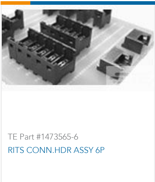
TE Part #1473565-6 RITS CONN.HDR ASSY 6P