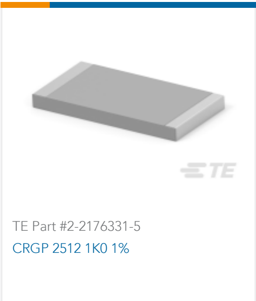
TE Part #2-2176331-5 CRGP 2512 1K0 1%