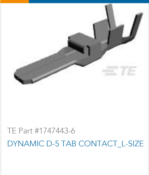
TE Part #1747443-6 DYNAMIC D-5 TAB CONTACT_L-SIZE