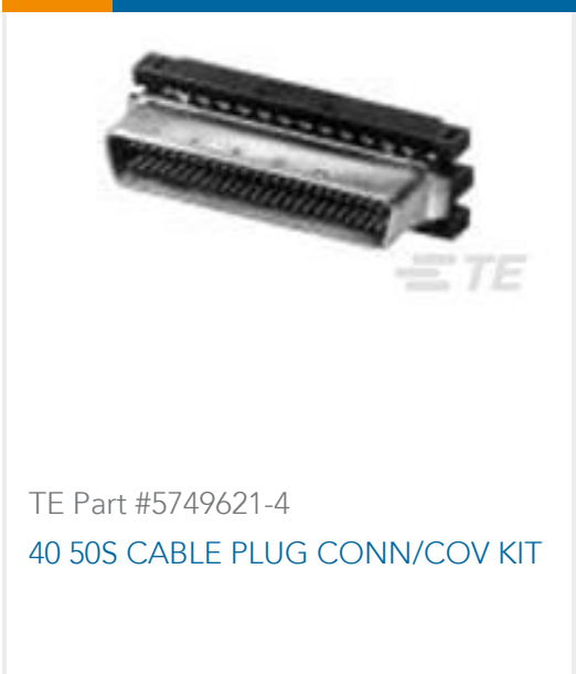
TE Part #5749621-4 40 50S CABLE PLUG CONN/COV KIT