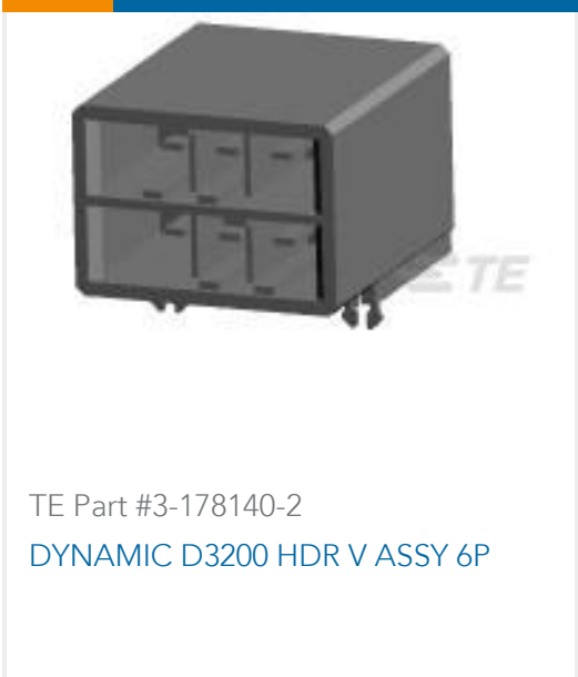
TE Part #3-178140-2 DYNAMIC D3200 HDR V ASSY 6P