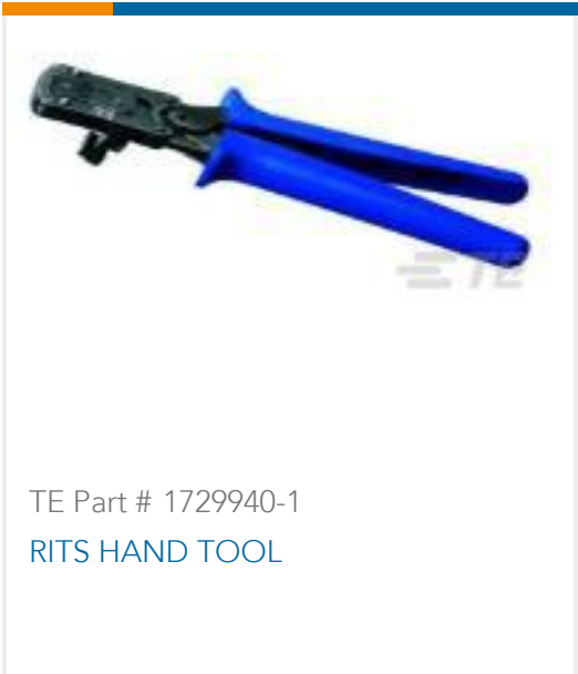
TE Part # 1729940-1 RITS HAND TOOL