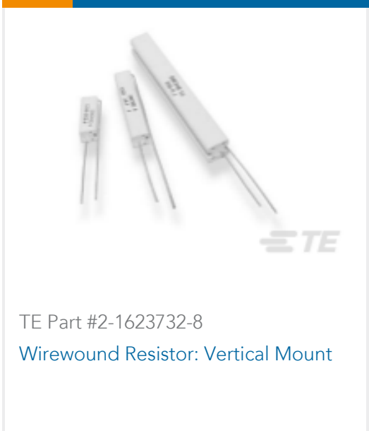
TE Part #2-1623732-8 Wirewound Resistor: Vertical Mount