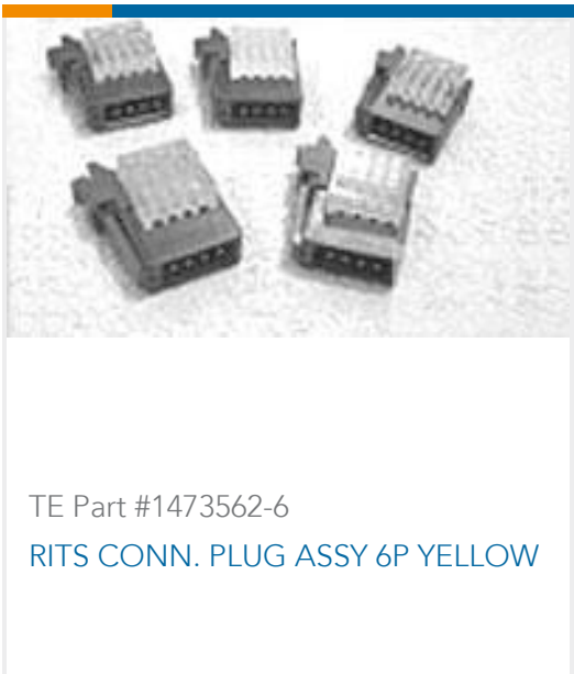
TE Part #1473562-6 RITS CONN. PLUG ASSY 6P YELLOW