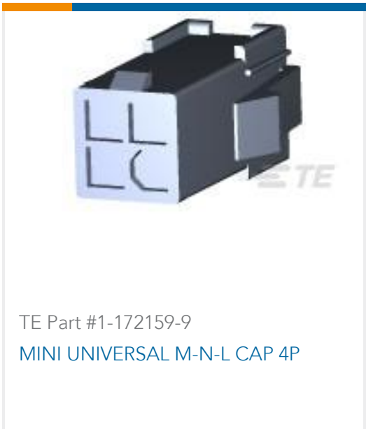
TE Part #1-172159-9 MINI UNIVERSAL M-N-L CAP 4P