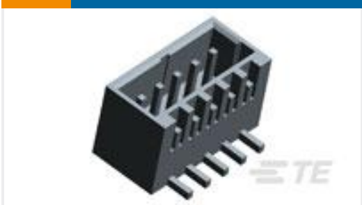
TE Part #5-1775443-4 EMIX CONN., 1.5MM PITCH, HDR, V/T, 4P