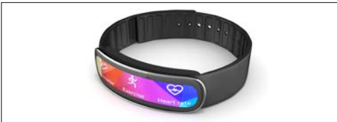
Wearables (Smart Watches, Health Monitors, AR & VR)