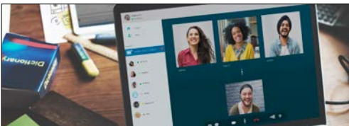
5G Networking/Telecommunications Communication Modules (WiFi Routers and Mesh Devices)