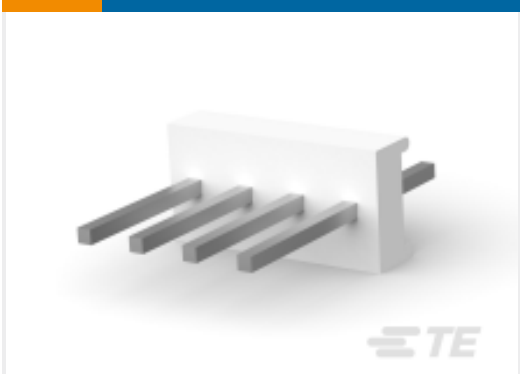
TE Part #640456-7 PCB Header: Polyester, Vertical, Unshrouded, No Mating Alignment