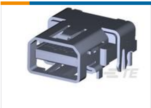
TE Part #2129320-3 Mini Displayport Reverse Offset