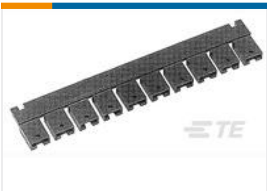
TE Part #382811-8 SHUNT, ECON, PHBR 5AU, BLACK