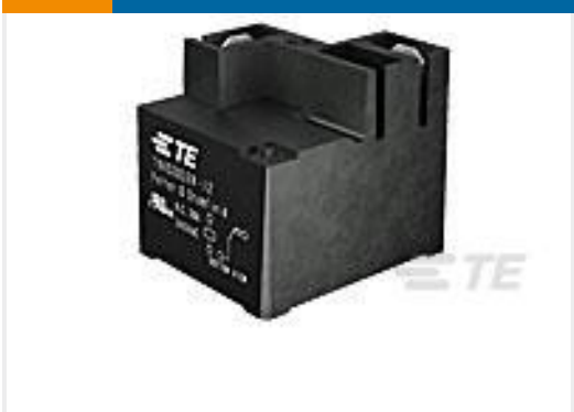
TE Part #1-1393210-3 T9AS1D12-12