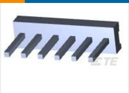
TE Part #640383-6 06P MTA156 HDR ASSY STR SQ SN