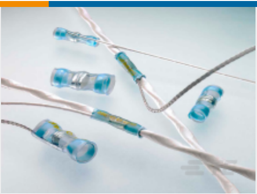
TE Part #EJ3514-000 S200-3-55-22-9CS2904