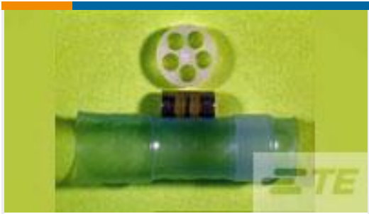
TE Part #650140-000 D-436-53