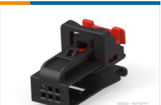
TE Part #2294663-1 6P MQS SHEILD ASSY WITH CPA