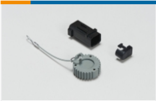
Automotive Connector Caps & Covers (5)