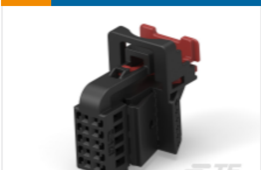
TE Part #2310000-1 10POS,MQS,REC HSG ASSY,UNSLD, COD A