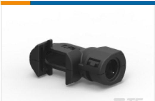
TE Part #2272169-1 MCON WIRE DRESS, 2P PLUG, RIGHT ANGLE