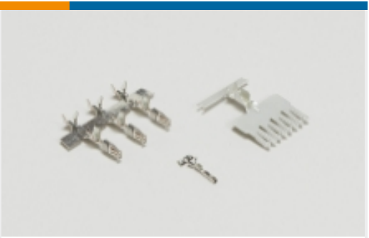
Busbars & Terminals(1)