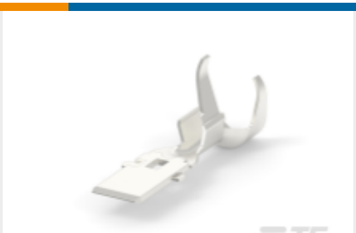
TE Part #1-2287018-3 TAB 9.5X1.2,6SQMM,AG