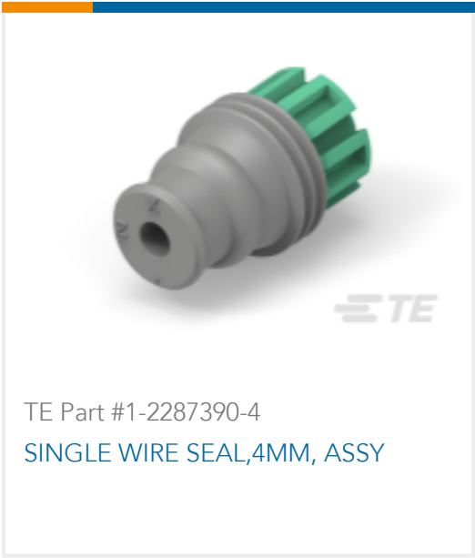
TE Part #1-2287390-4 SINGLE WIRE SEAL,4MM, ASSY

Receptacle Assembly, 4 position, Sealed, English