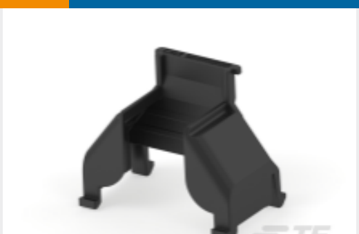
TE Part #2354595-1 REC CONN CVR,30POS,0.5 SERIES, STRAIGHT