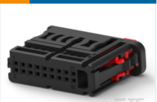
TE Part #2312118-1 18POS,NANOMQS,REC HSG ASSY, COD A