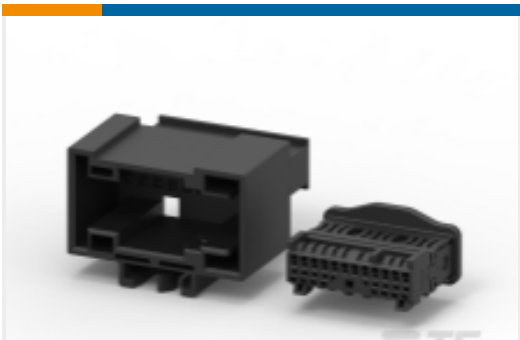
TE Part #2309644-1 MQS, CONNECTOR HOUSING