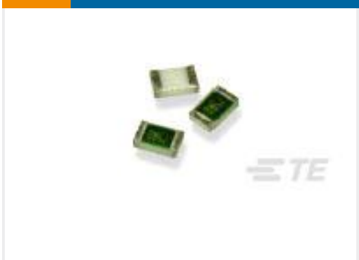
TE Part #6-1879208-9 CPF 0402 6K8 0.1% 25PPM 1K RL