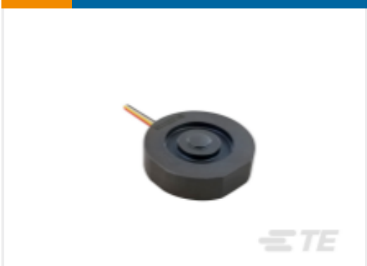
TE Part #20009605-14 Compact Compression Load Cell