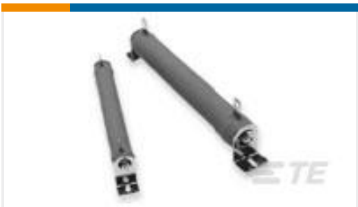
TE Part #2-1879457-3 TE 2500W 68R 5% Bracket