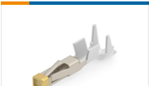
TE Part #2-2834067-3 SOCKET CONTACT,MINIATURE WATERPROOF CONN