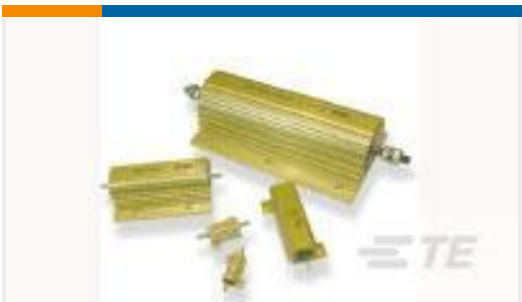
TE Part #1625999-8 HSC100 180R 5%