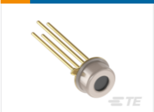
TE Part #G-TPCO-032 Analog Thermopile TO-18, FOV 110, NTC Ref