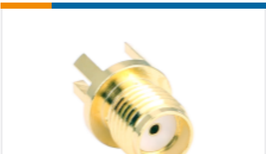
TE Part #L9000267-01 SMA Jack 50 Ohm .062 PCB Edge Mount