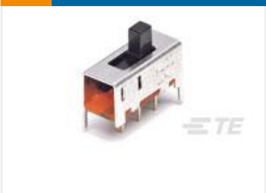
TE Part #1825257-1 MSS120004=SPDT SL SW VERT AG