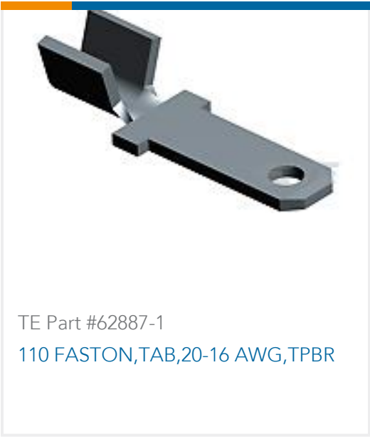
TE Part #62887-1 110 FASTON, TAB, 20-16 AWG, TPBR