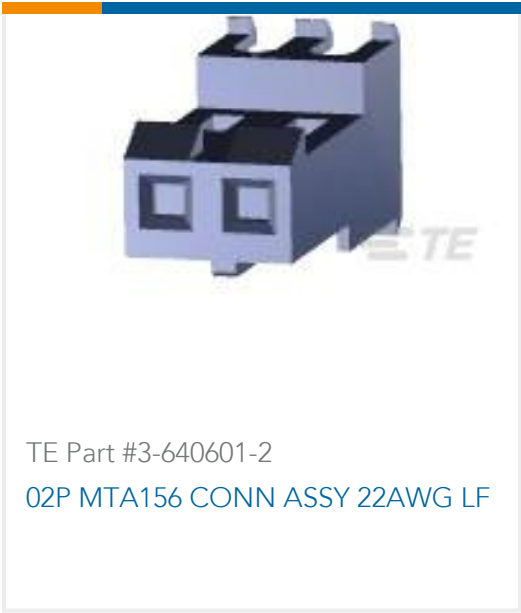
TE Part #3-640601-2 02P MTA156 CONN ASSY 22AWG LF