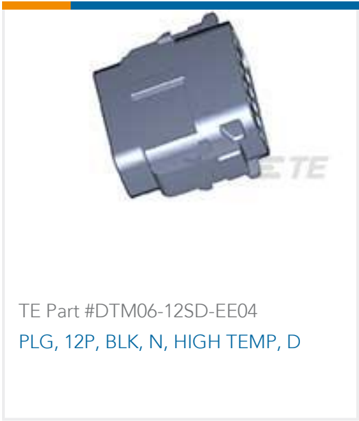
TE Part #DTM06-12SD-EE04 PLG, 12P, BLK, N, HIGH TEMP, D