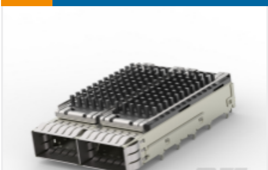
TE Part #2170806-2 CAGE ASSEMBLY, 1X2, QSFP28, SPRING, HS