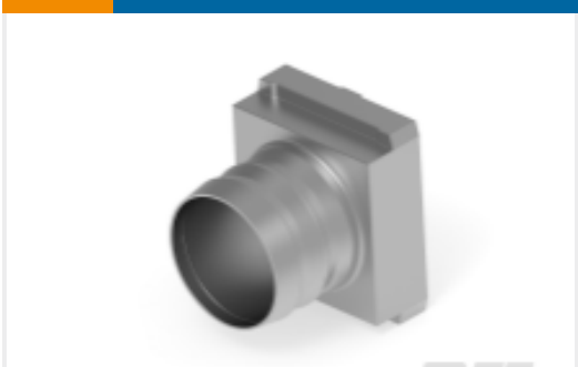
TE Part #1-2308349-1 CRIMP FLANGES SMALL