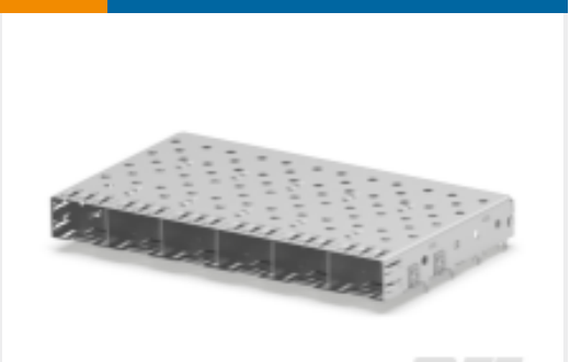
TE Part #2007498-2 1X6 SFP PCI Cage Assembly