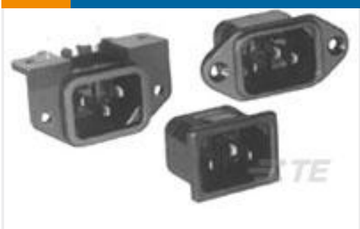
TE Part #1609133-1 6ESRF-3=F6988