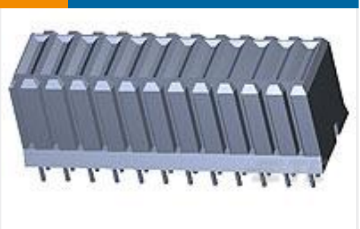
TE Part #120953-4 UPM EXPANDED RCPT ASSEMBLY