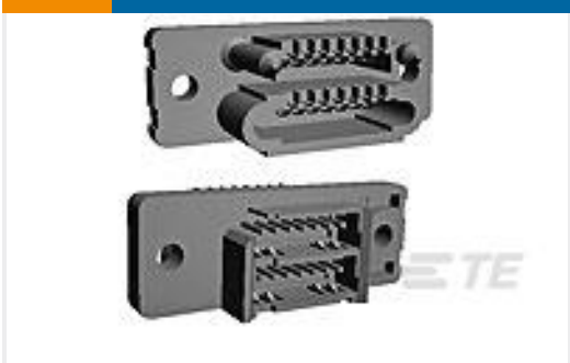
TE Part #5-292177-1 MINI DRAWER CONN FOR CT 14P