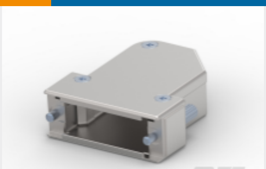
TE Part #2-2308341-0 FULL METAL HOODS SIZE 2-10 (RAW 135 DEG)