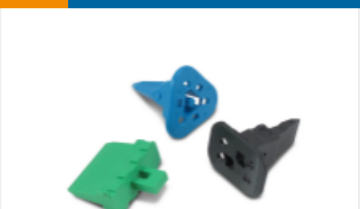
TE Part #W2S Wedgelocks: DEUTSCH DT