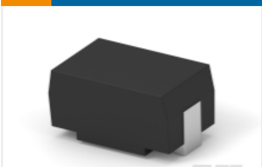
TE Part #7-2176459-7 SMD Power Resistor: 7 Watt, 0.10-500 Ohm