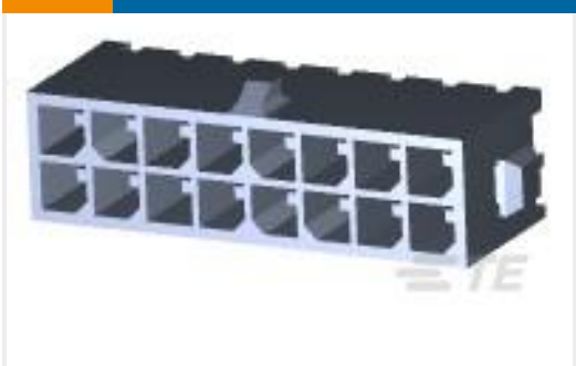
TE Part #4-794632-6 16P MICRO MNL ASSY,VRT,HDR,LF