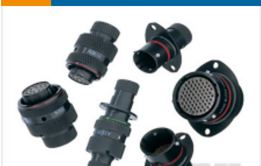
TE Part #AS107-35PA RECEPT. IN LINE TYPE 1 AS MICRO 7