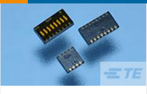
TE Part #1977830-1 DIP SWITCH GDH02SA04