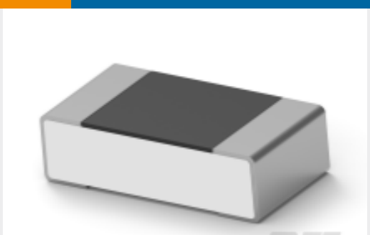
TE Part #3-2176371-5 RQ 0603 10K5 0.1% 10PPM 5K RL