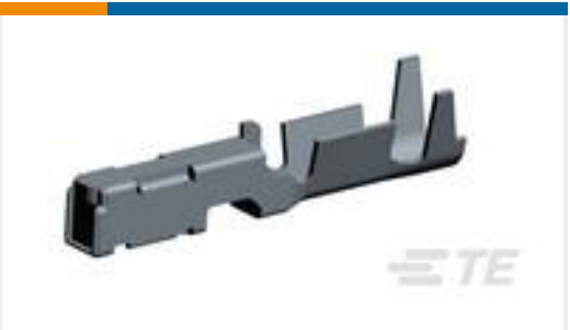
TE Part #1924955-3 CONTACT,FEMALE0.64,20-22AWG, UNSEAL