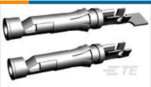
TE Part #1-66360-1 III+ SKT,18-14,30AU/FL,SMPACK