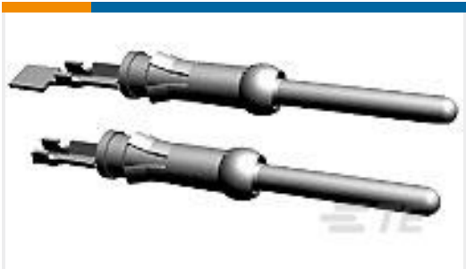
TE Part #1-66103-7 III+ PIN,24-20, 30AU/SN,SMPACK