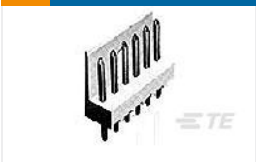
TE Part #171825-7 V-TYPE E.I.S.CONN. 7P ASSY