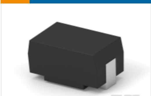
TE Part #4-1879234-4 SMD Power Resistor: 7 Watt, 200-2M Ohm