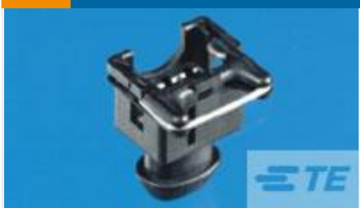
TE Part #282194-1 SPLASH PROOF CONN. W.S.L.