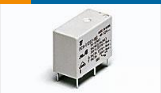
TE Part #9-1440003-0 PCH-105D2H,000