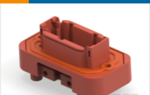
TE Part #DTM15-12PD HDR, 12P, GRY, ST, NI/CU, D