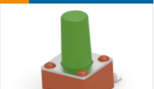
TE Part #2-1977223-4 FSM8JSMASSTR=6MM TACT SWITCH, SMT 160gf,