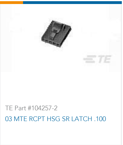
TE Part #104257-2 03 MTE RCPT HSG SR LATCH .100