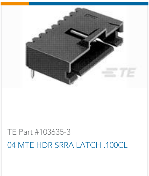
TE Part #103635-3 04 MTE HDR SRRA LATCH .100CL

Datasheets & Catalog Pages 915 MHz Helical Antenna English