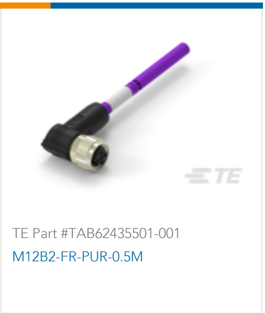
TE Part #TAB62435501-001 M12B2-FR-PUR-0.5M