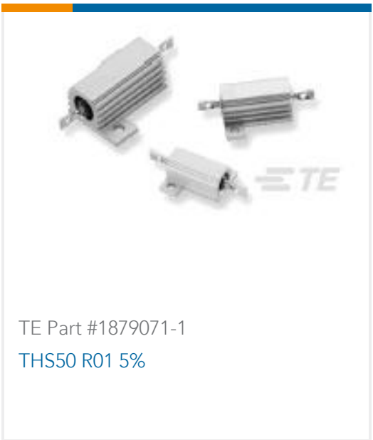
TE Part #1879071-1 THS50 R01 5%