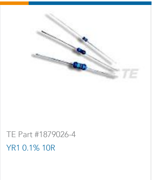
TE Part #1879026-4 YR1 0.1% 10R