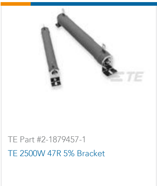
TE Part #2-1879457-1 TE 2500W 47R 5% Bracket