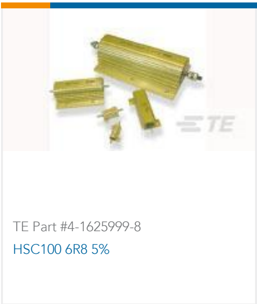
TE Part #4-1625999-8 HSC100 6R8 5%