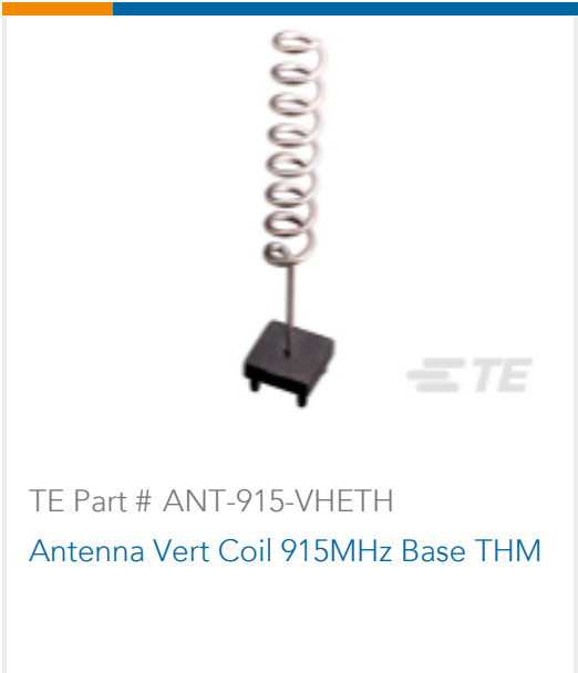
TE Part # ANT-915-VHETH Antenna Vert Coil 915MHz Base THM