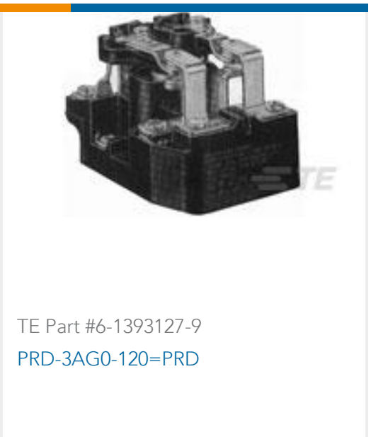
TE Part #6-1393127-9 PRD-3AG0-120=PRD