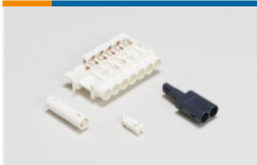
Plug & Socket Lighting Connectors(54)