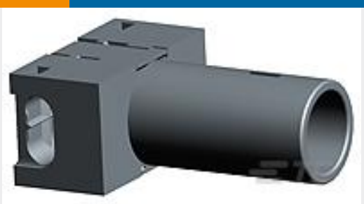
TE Part #1-2213222-1 NECTOR S BUS BAR SEALED US, THRU HV-3