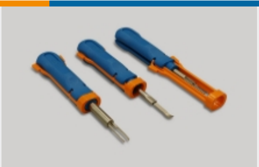
Insertion & Extraction Tools(3)