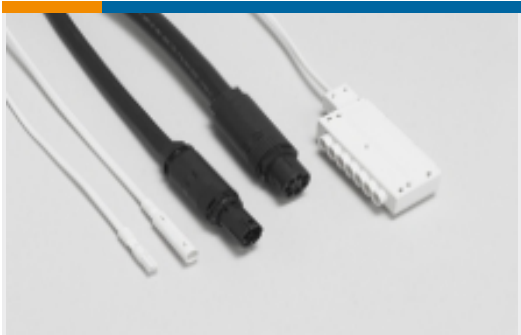
Lighting Cable Assemblies(1)