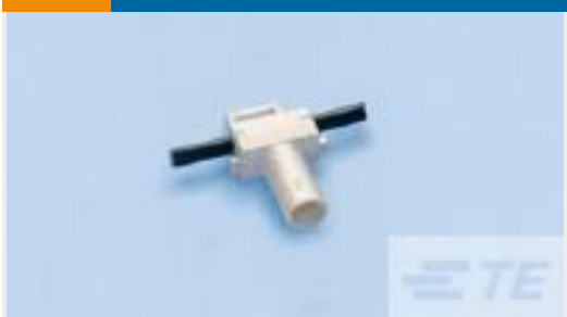
TE Part #293270-3 NECTOR S BUS BAR SEALED CONN HV-1