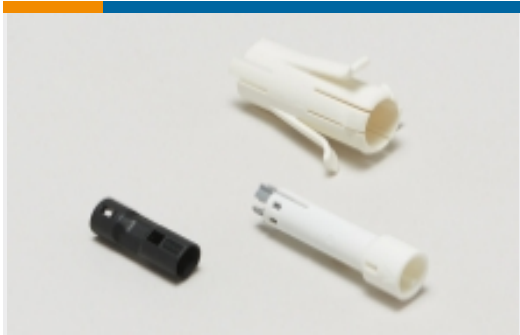
Plug & Socket Lighting Connector Accessories(57)