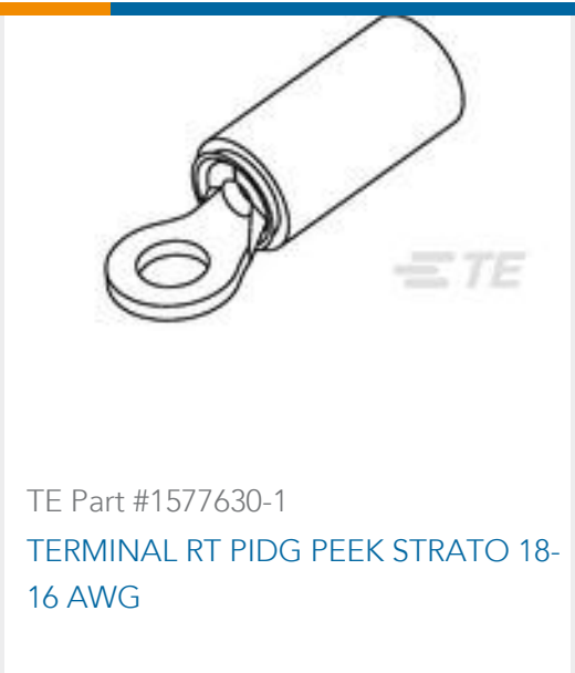
TE Part #1577630-1 TERMINAL RT PIDG PEEK STRATO 18-16 AWG