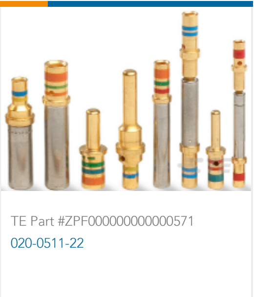
TE Part #ZPF000000000000571 020-0511-22