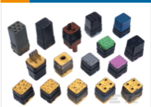
TE Part #ZPF000000000015218 DMC-M 08-16 AN