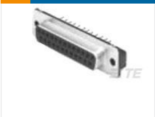
TE Part #1-747150-6 09 RCPT SP/FMS SCRLK