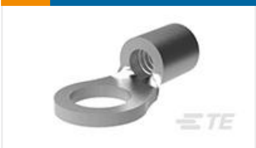
TE Part #32859-1 BUDGET,RING,26-22,8,UNPLTD