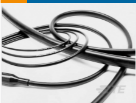
TE Part #CB7838-000 Single Wall RW 200: Heat Shrink Tubing, 2:1 Shrink Ratio