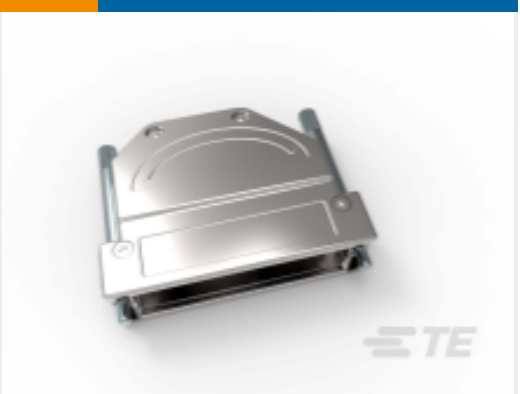
TE Part #1-2308346-5 FULL METAL HOODS SIZE 5 - 5 (RAW)