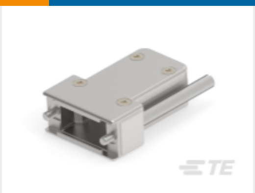
TE Part #1-2308340-5 FULL METAL HOODS SIZE 1-5 (RAW 180 DEG)