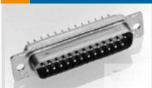
TE Part #204520-2 RECEPT ASSY,78 POSN,AMPLIMITE