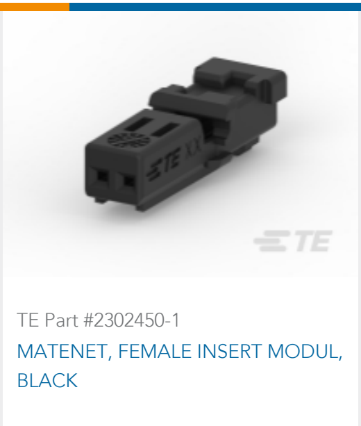
TE Part #2302450-1 MATENET, FEMALE INSERT MODUL, BLACK