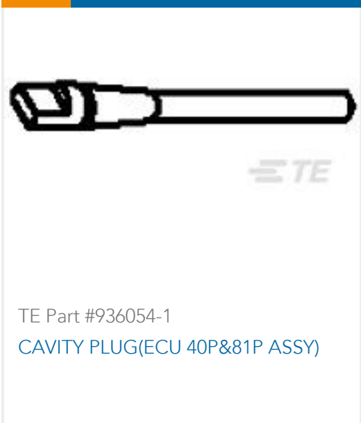
TE Part #936054-1 CAVITY PLUG(ECU 40P&81P ASSY)