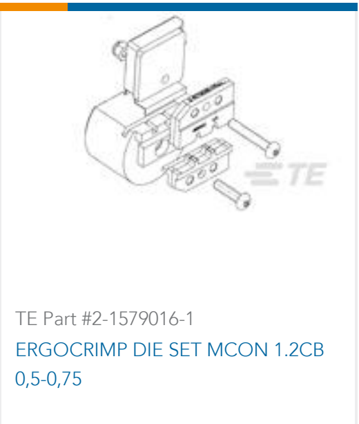
TE Part #2-1579016-1 ERGOCRIMP DIE SET MCON 1.2CB 0,5-0,75