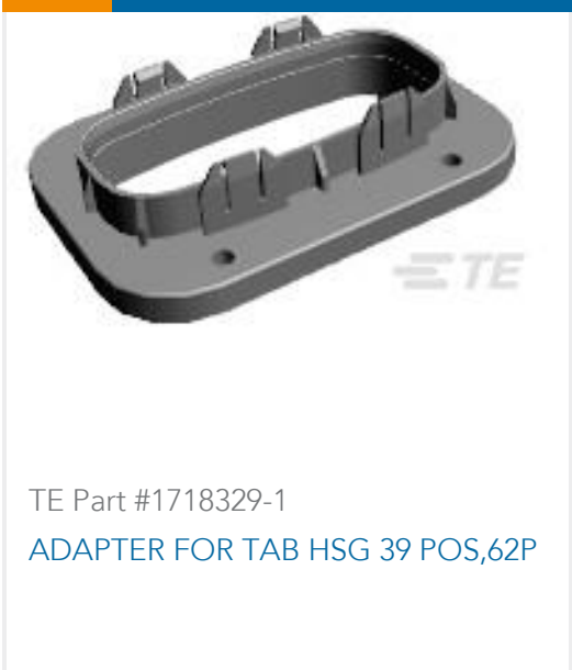
TE Part #1718329-1 ADAPTER FOR TAB HSG 39 POS,62P