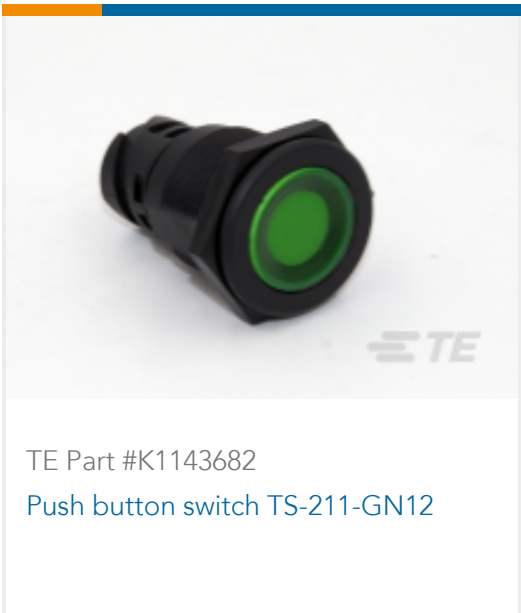
TE Part #K1143682 Push button switch TS-211-GN12