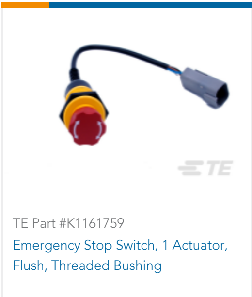
TE Part #K1161759 Emergency Stop Switch, 1 Actuator, Flush, Threaded Bushing