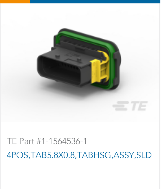
TE Part #1-1564536-1 4POS,TAB5.8X0.8,TABHSG,ASSY,SLD