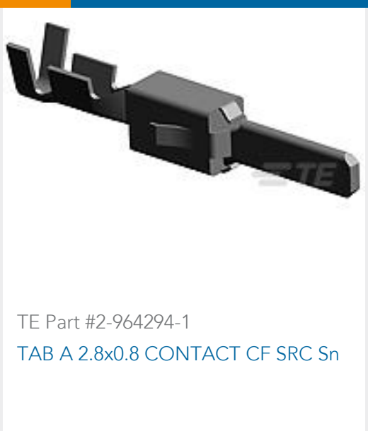
TE Part #2-964294-1 TAB A 2.8x0.8 CONTACT CF SRC Sn