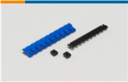
Board-to-Board Jumpers & Shunts(7)