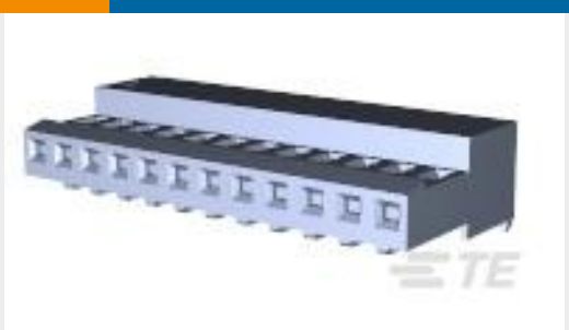
TE Part #4-641190-2 12P MTA100 CONN ASSY RED LF