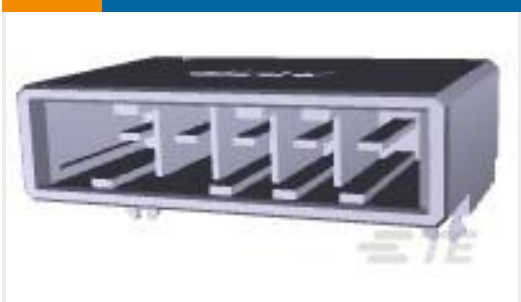
TE Part #1-316130-5 DYNAMIC D-3200 HDR ASSY 5P H