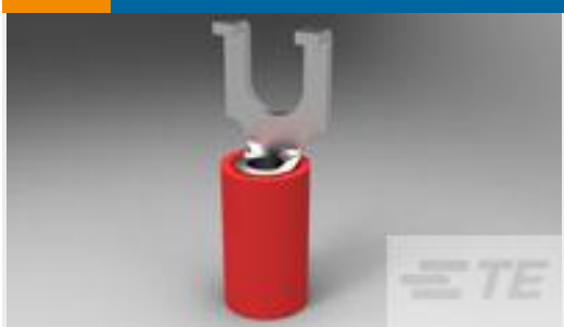
TE Part #2-32562-2 PIDG SPDFLG 22-16COM22-18MIL 8