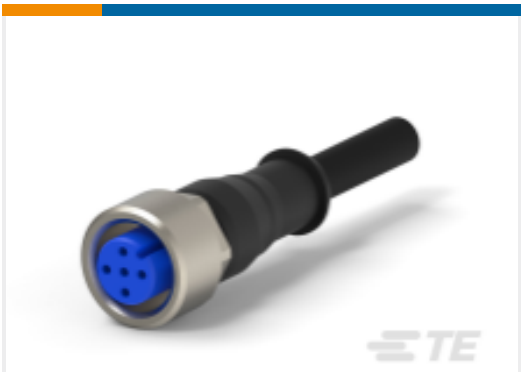
TE Part #1-2273045-4 M12 A-Code Pigtail, Female, Straight