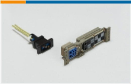
Rack & Panel Connectors(1)