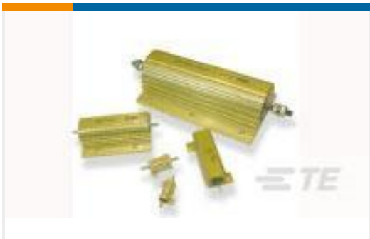
TE Part #2-1676625-7 HSA25 240R 5%