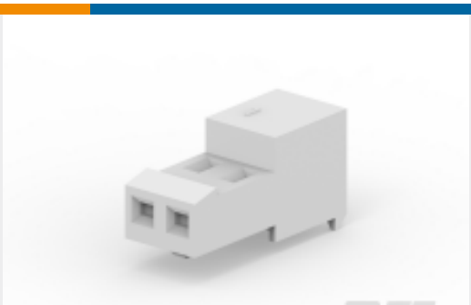
TE Part #3-640441-7 MTA Receptacle: Nylon, Tin Plated, 2.54 mm