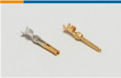
D-Sub Connector Contacts(5)