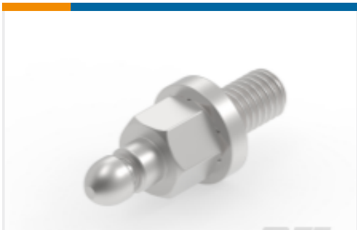
TE Part #1-2308265-7 QL SET FOR VARIANT B 7