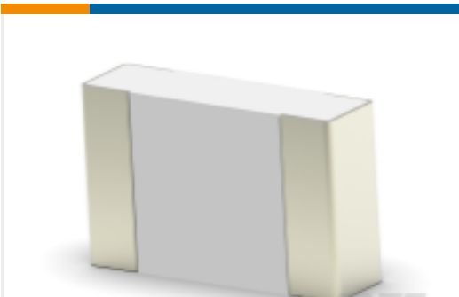
TE Part #2176244-1 CRGS0805 5% 1R0