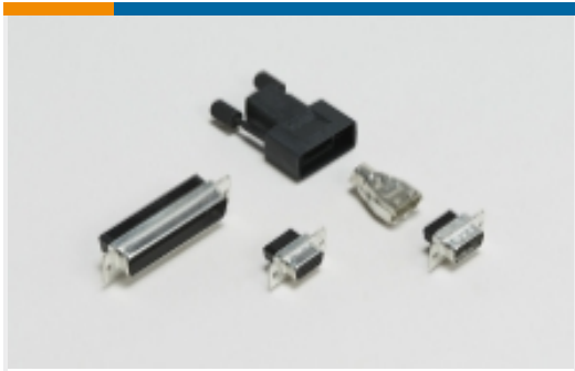
Crimp D-Sub Connectors(10)