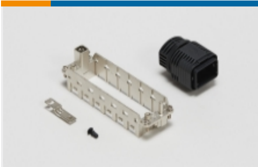
Rectangular Connector Hardware(19)