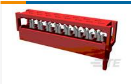
TE Part #1-215083-6 MICRO-MATCH MOW.16P