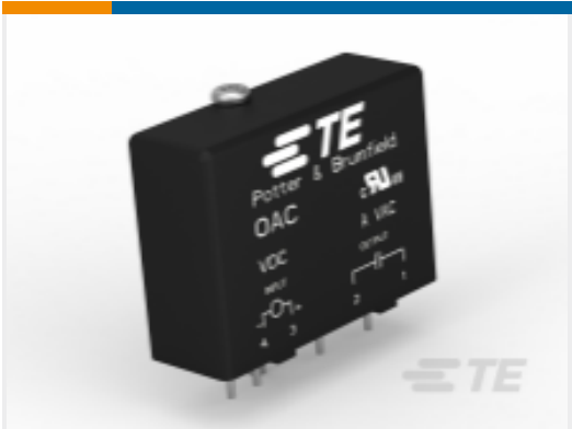
TE Part # CAT-P851-OA1 Solid State Relays: PCB mount

This information is provided based on reasonable inquiry of our suppliers and represents our current actual knowledge based on the information they provided. This information is subject to change. The part numbers that TE has identified as EU RoHS compliant have a maximum concentration of 0.1% by weight in homogenous materials for lead, hexavalent chromium, mercury, PBB, PBDE, DBP, BBP, DEHP, DIBP, and 0.01% for cadmium, or qualify for an exemption to these limits as defined in the Annexes of Directive 2011/65/EU (RoHS2). Finished electrical and electronic equipment products will be CE marked as required by Directive 2011/65/EU. Components may not be CE marked. Additionally, the part numbers that TE has identified as EU ELV compliant have a maximum concentration of 0.1% by weight in homogenous materials for lead, hexavalent chromium, and mercury, and 0.01% for cadmium, or qualify for an exemption to these limits as defined in the Annexes of Directive 2000/53/EC (ELV). Regarding the REACH Regulation, the information TE provides on SVHC in articles for this part number is based on the latest European Chemicals Agency (ECHA) 'Guidance on requirements for substances in articles' posted at this URL: https://echa.europa.eu/guidance-documents/guidance-on-reach