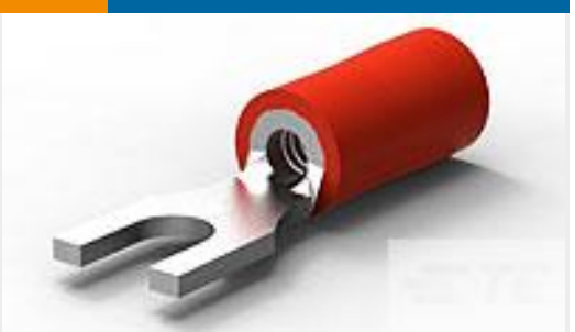
TE Part #165004 PLASTI-GRIP, SPADE 22-16 4