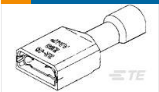
TE Part #3-350816-2 ULTRAFAST 187 ASSY REC 16-14 TPBR LP