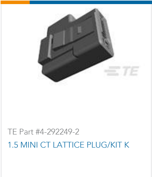
TE Part #4-292249-2 1.5 MINI CT LATTICE PLUG/KIT K