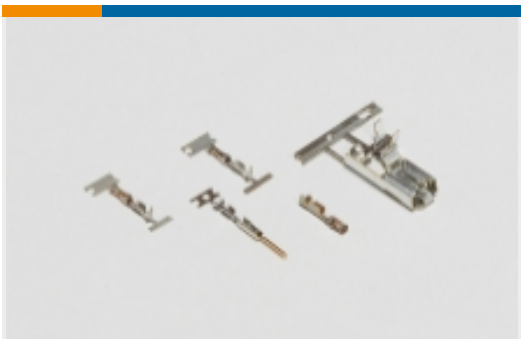
Wire-to-Board Connector Contacts(2)