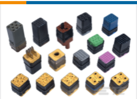
TE Part #ZPF000000000148762 DMC-M 99-04 AN (=33537-P0000)

Product Drawings 1-4 POS. MULTIFIT MK2 ASSY