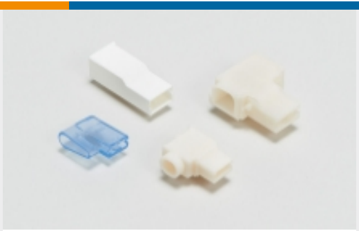
Crimp Terminal Housings(41)