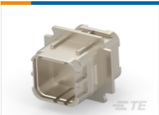
TE Part #ZPF000000000146309 Rectangular Connector Receptacle Extenders, Tool-less Assembly