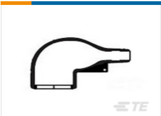
TE Part #EF9981-000 222K121-25L/225-0