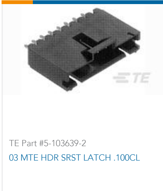
TE Part #5-103639-2 03 MTE HDR SRST LATCH .100CL