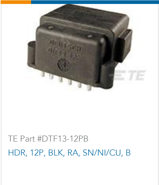
TE Part #DTF13-12PB HDR, 12P, BLK, RA, SN/NI/CU, B