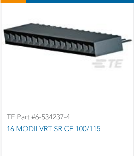
TE Part #6-534237-4 16 MODII VRT SR CE 100/115