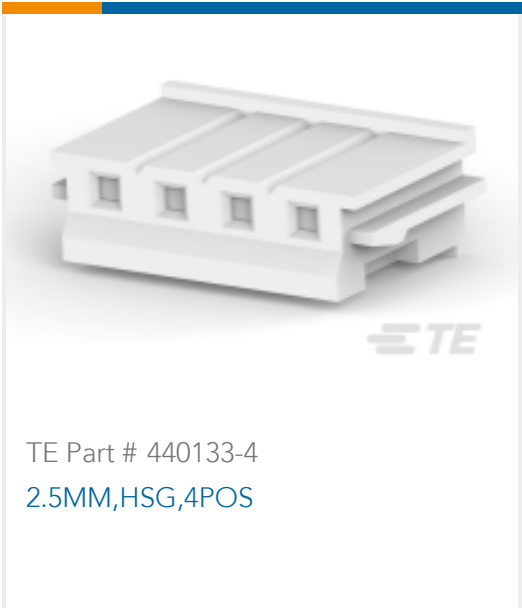
TE Part # 440133-4 2.5MM,HSG,4POS