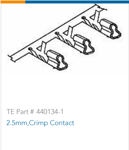
TE Part # 440134-1 2.5mm,Crimp Contact