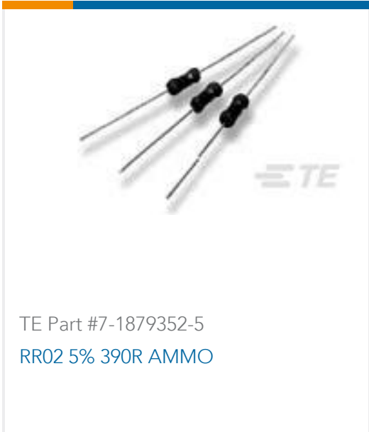
TE Part #7-1879352-5 RR02 5% 390R AMMO