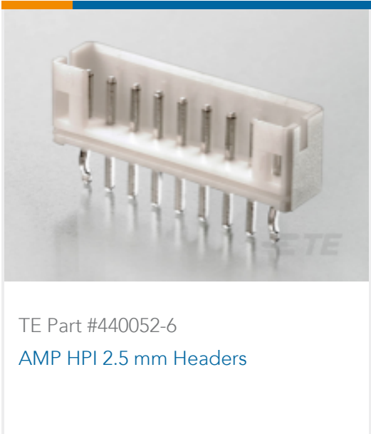
TE Part #440052-6 AMP HPI 2.5 mm Headers