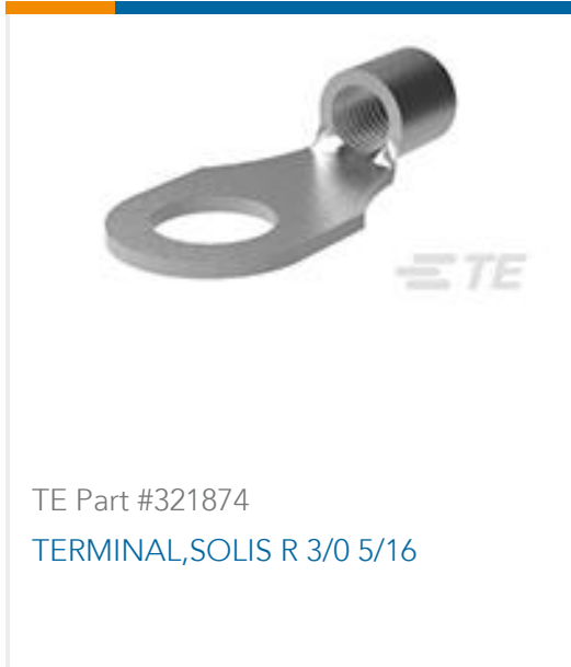
TE Part #321874 TERMINAL,SOLIS R 3/0 5/16