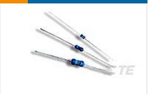
TE Part #4-1676914-1 YR1 0.1% 49K9