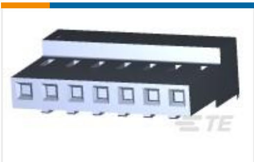
TE Part #3-640435-7 07P MTA156 CONN ASSY 26AWG LF