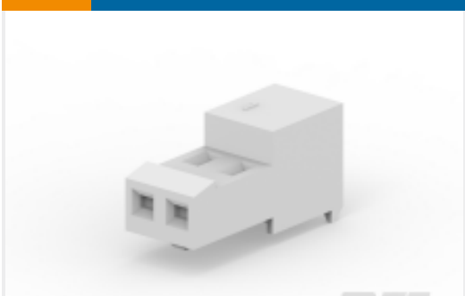
TE Part #3-641534-2 MTA Receptacle: Nylon, Tin Plated, 2.54 mm