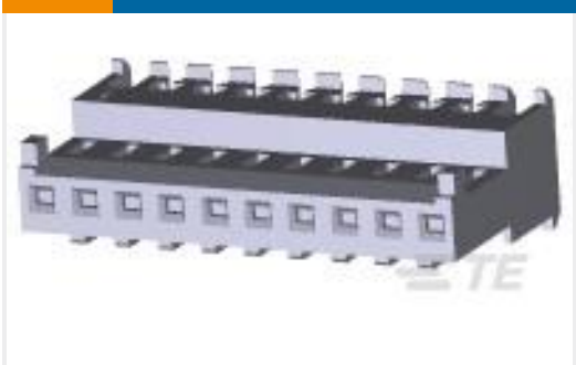
TE Part #4-644563-0 10P MTA100 CONN ASSY F/T 24AWG