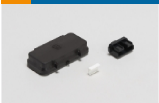
Rectangular Caps & Covers(2)