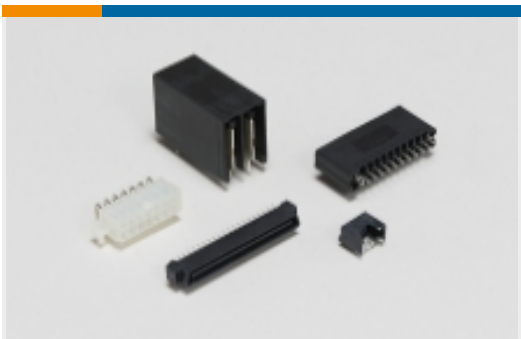
Standard Rectangular Connectors(7)