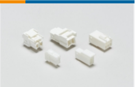
Rectangular Power Connectors(169)