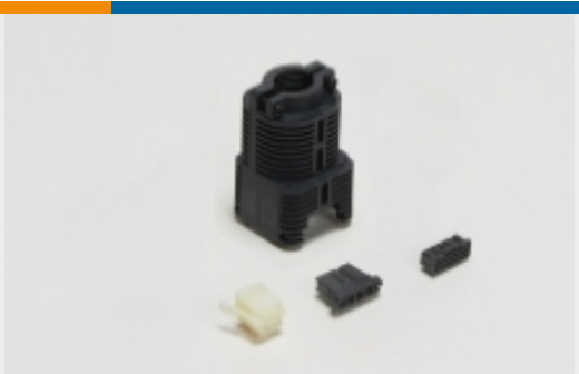
Rectangular Connector Housings(11)