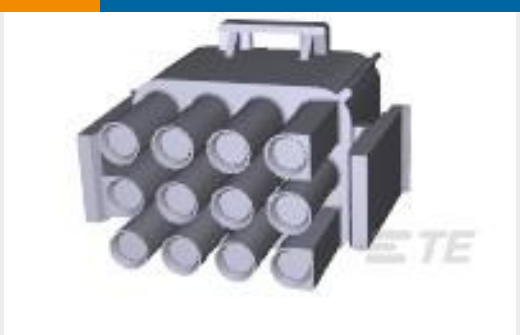
TE Part #350735-4 12P UMNL PLUG HSG UL94VO