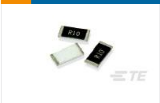
TE Part #2176055-1 RLP73V 2B R010 1% 1K RL