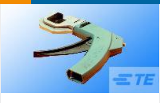
TE Part #58246-1 MTA 100 CRIMP HEAD REPAIR DISCRETE