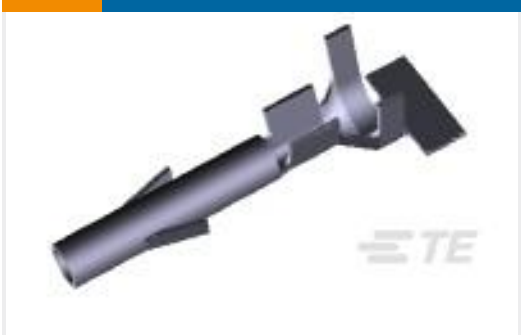
TE Part #350537-6 UMNL SOK 20-14 .0125 AUNI/PHBZ