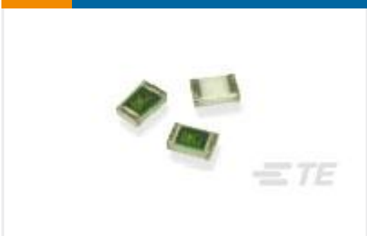
TE Part #3-1614354-4 RN 0603 61R9 0.1% 10PPM CUT LENGTH