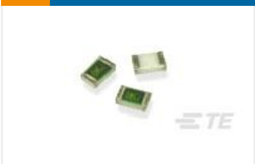
TE Part #7-2176087-2 RP 1J 0.166W 383R 0.1% 25PPM 1K RL