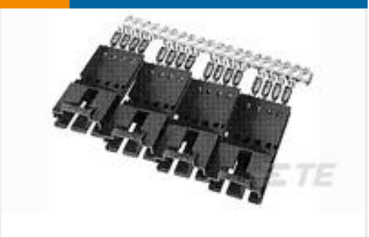
TE Part #5-103945-4 4X5 MTE SHRD PIN SR LATCH .100