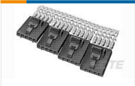
TE Part #5-103961-3 5X4 MTE RCPT SR LATHC .100CL