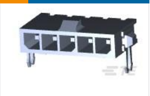
TE Part #2-1445090-5 MICRO MNL HDR ASSY S/ROW AU LF