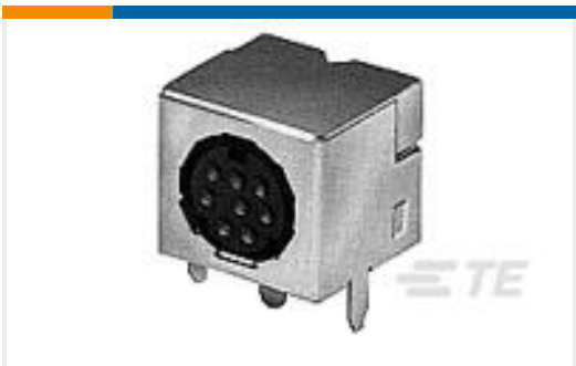
TE Part #5749266-1 Mini DIN, 6 pos, R/A, Shield