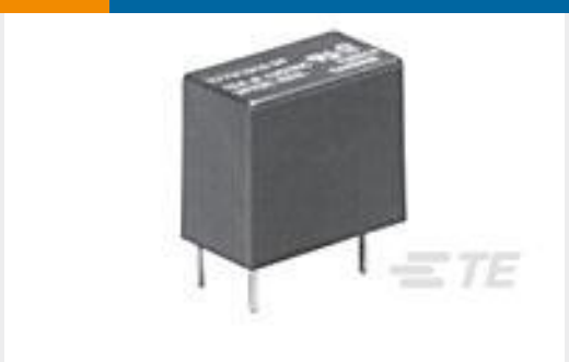
TE Part #1393194-7 T77S1D10-05