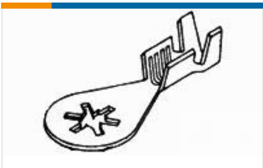
TE Part #61795-3 RING 18-14 AWG TPBR