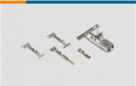
Wire-to-Board Connector Contacts(8)