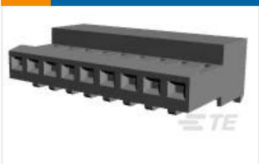
TE Part #3-640441-9 09P MTA100 CONN ASSY WHT