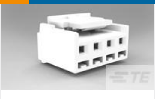
TE Part #2132781-7 07P EP-II HOUSING, NATURAL