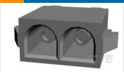
TE Part #350759-4 02P UMNL HDR ASSY PC V2 NATL