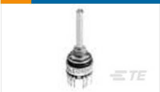
TE Part #1825537-3 MRJE3404