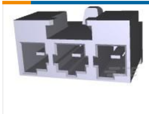
TE Part #179846-1 AMP POWER D/LOCK T/HDR ASSY 3P