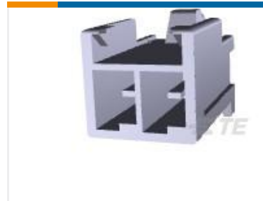
TE Part #179838-2 AMP POWER D/LOCK T/HDR ASSY 2P