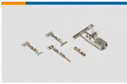
Wire-to-Board Connector Contacts(3)