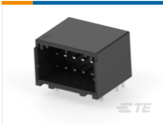
TE Part #1-1827876-3 Header Assembly: Wire-to-Board, 5A, gold or tin plated