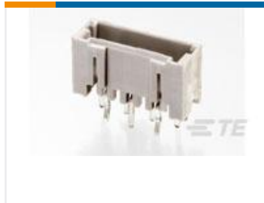
TE Part #292207-7 MINI CT SGL DIP V 7P NAT