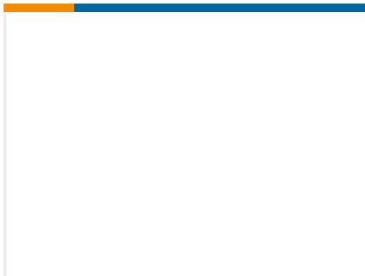
TE Part #855036-E CFGCA SRC 26R 04 FL ST STI PVC 400 ANN