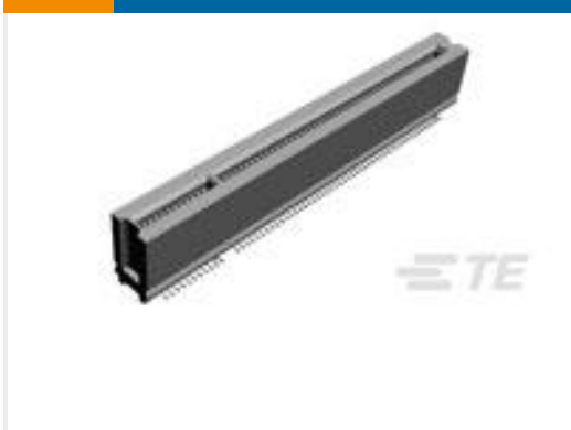
TE Part #5145098-1 CONNECTOR ASSEMBLY, DUAL POSIT