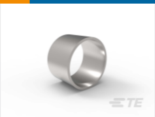
TE Part #1-2308350-2 Crimp Barrel for D-Sub Connectors