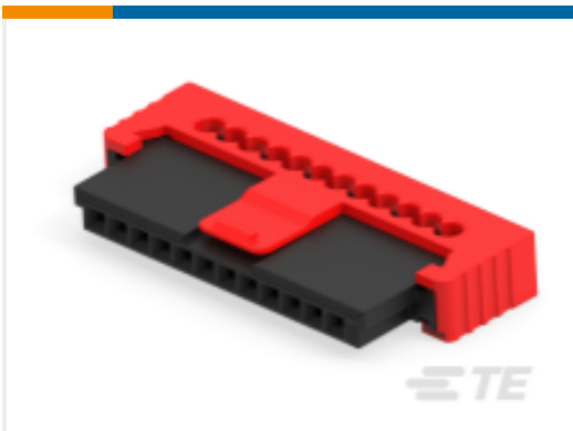
TE Part #464242-E SRCP 1,27 12 F 1 IDC22 137 E1 162 1,27 T