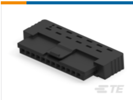
TE Part #464262-E SRCA 1,27 12 F 1 IDC22 137 E1 094 1,27 T