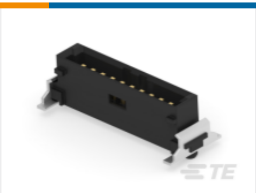
TE Part #294919-E SRCP 1,27 10 M 1 SMD 137 E1 094 * GU-H *