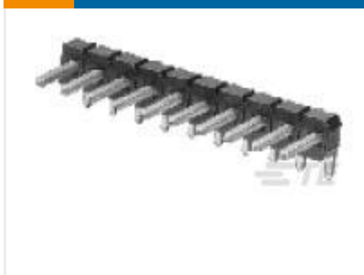
TE Part #5-826949-0 50P MOD2 STIFT LEI