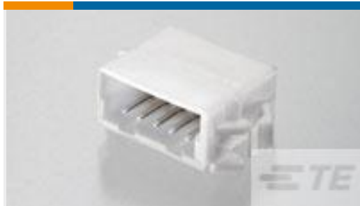
TE Part #292254-2 CT RELAY HDR ASSY 2P NAT