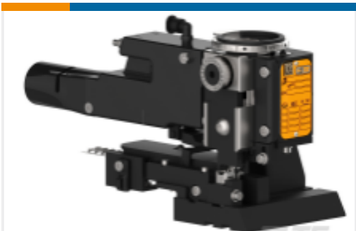
TE Part #2-2837034-2 OCEAN_2.0_Applicator-S-055F075OV