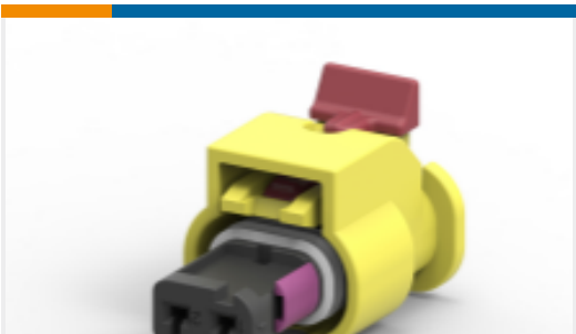
TE Part #1-2299071-1 2POS, MCON 1.2 LL REC SEALED