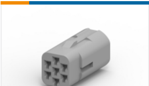
TE Part #2822343-4 MINI MLC PLUG HSG ASSY 7P