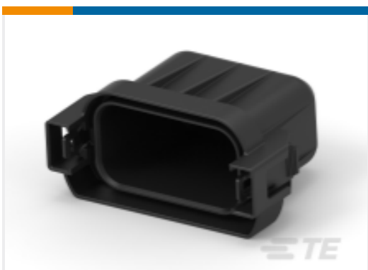
TE Part #2319021-2 REC CONN CVR,8POS,AMP MCP 2.8, FRB