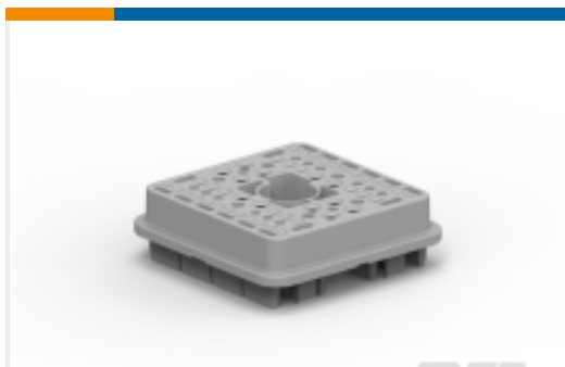
TE Part #WB-48SA WEDGE LOCK, 48P, PLG, GRY, DRB, A