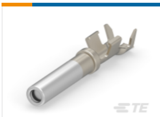
TE Part #1062-16-0144-PS SOC, SF, SIZE 16, 14-18, AU/SN, 100 PC