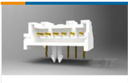
TE Part #1744426-3 Header Housing Assy, EP 2.5 RA, 3 Pos.