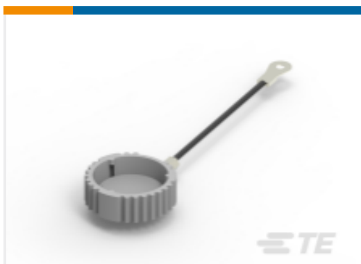
TE Part #429596-ZZ DUST CAP.HD10.WITH 115mm NYLON C