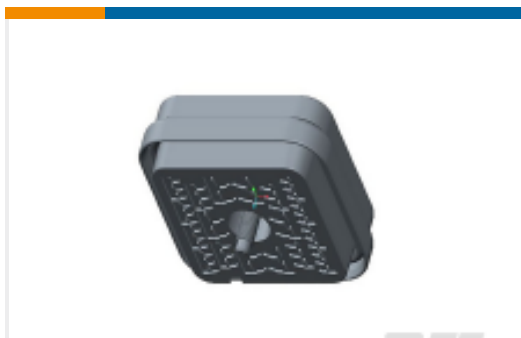
TE Part #DRB16-48SAE-L018 PLG, 48P, BLK, E, CAP, A