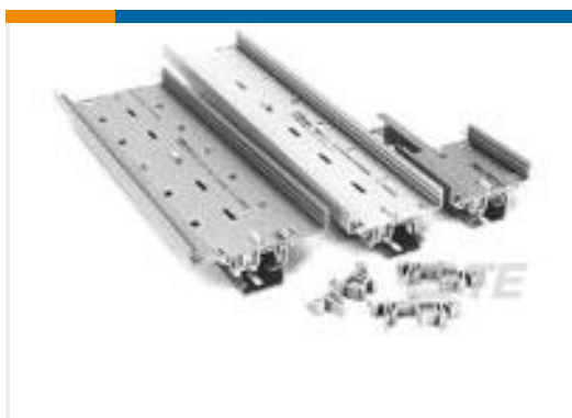
TE Part #6-1437685-4 8TK2-48=SNAP TRACK