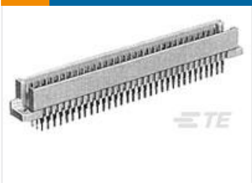
TE Part #650889-5 096 EURO TYPE R PIN AP ASSY