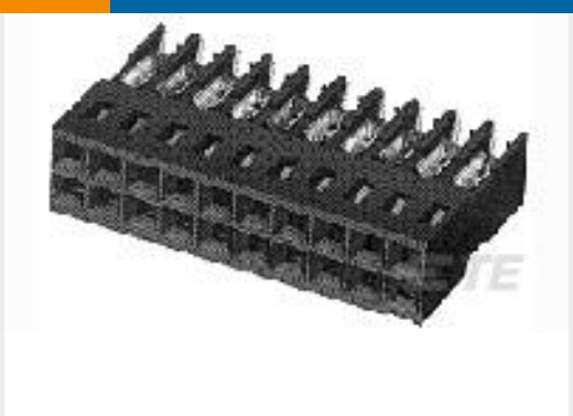
TE Part #5-102393-1 06 AMPMODU MT ASSY DR.100CL SN