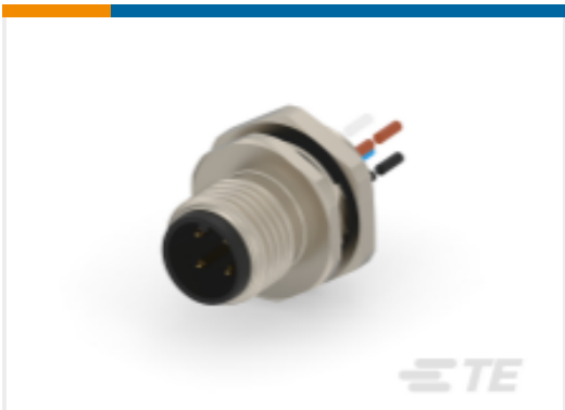
TE Part #T4171210004-001 M12,FRONT MOUNTING,MALE,A,4P, 0.2M WIRE