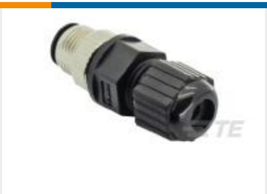
TE Part #1838275-4 M12 Fld Ser CONN. Male Pin Sldr