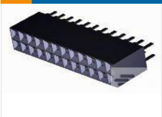
TE Part #1-534206-2 24 MODII VRT DR CE 100/115