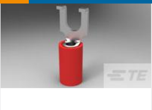
TE Part #32498 PIDG SPDFLG 22-16COM22-18MIL 8