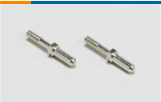
Docking Connector Guide Hardware(5)