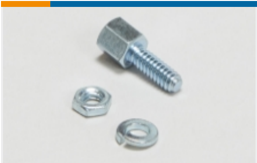
D-Sub Locking & Mounting(29)