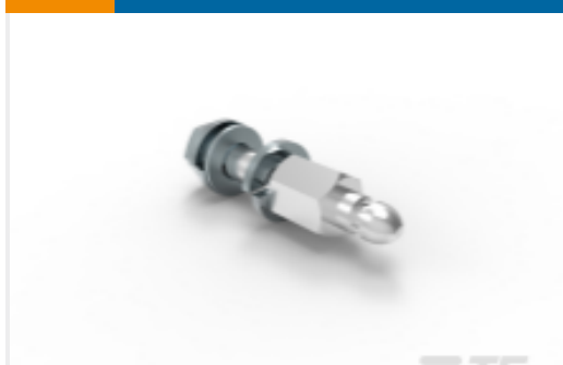
TE Part #1-2308290-1 QL-SET FOR VARIAN C VW REAR WALL MOUNTG

QL-SET VAR A W/STP MO FOR COMBLOCK M3THD