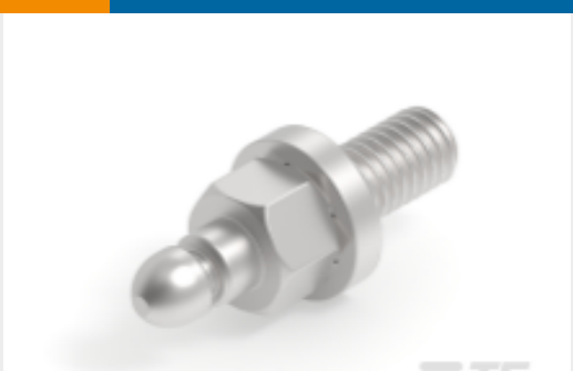
TE Part #2-2308265-0 QL SET FOR VARIANT B 10