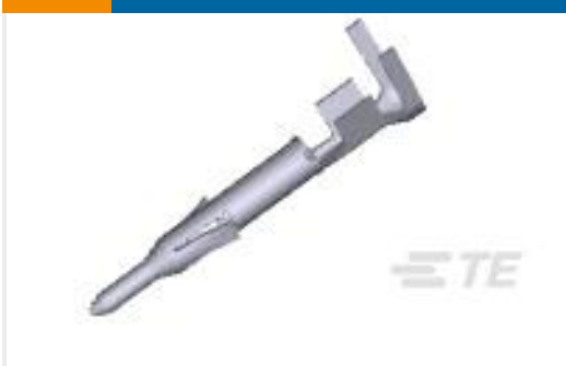
TE Part #170364-1 MINI UNIVERSAL M-N-L PIN LP