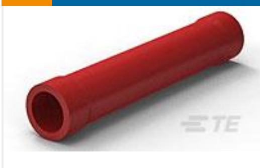
TE Part #34070 PG BUTT SPLC 22-16COMM22-18MIL