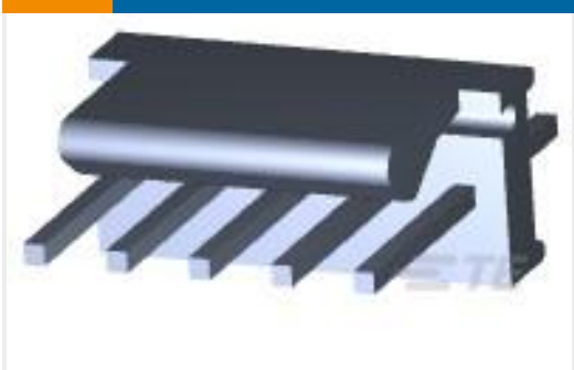
TE Part #3-641126-5 05P MTA100 HDR ASY FL/STR LF