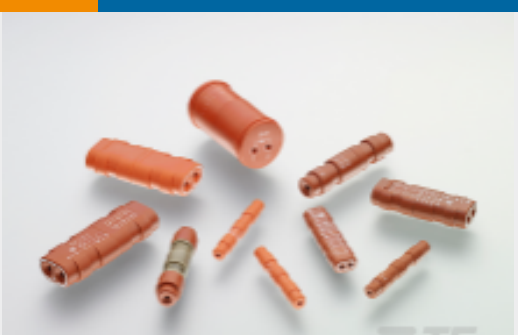
TE Part #CTL-22-513 JUNCTION ASSY