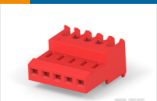
TE Part #3-641191-2 Nylon Gold Plated Receptacle: 2.54 mm, no Mating Alignment