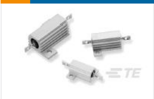
TE Part #4-1879074-2 THS15 5K6 5%