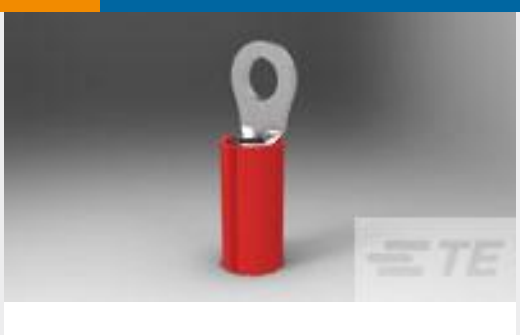
TE Part #2-36153-8 TERMINAL,PIDG R IR 20 10