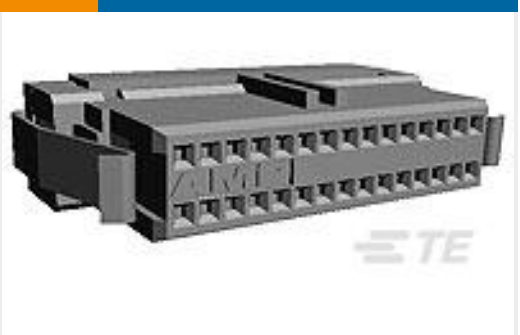
TE Part #1-111196-9 30 RCPT SYSTEM 50, LEAD FREE