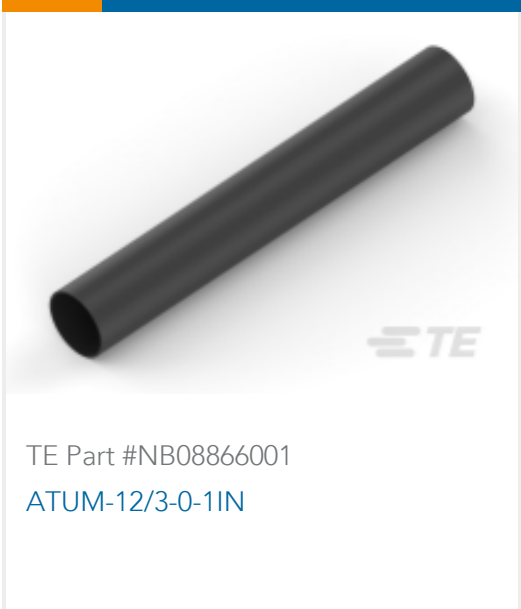
TE Part #NB08866001 ATUM-12/3-0-1IN