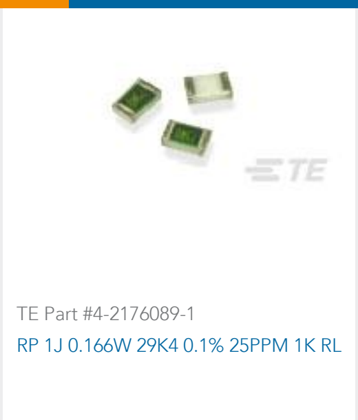
TE Part #4-2176089-1 RP 1J 0.166W 29K4 0.1% 25PPM 1K RL