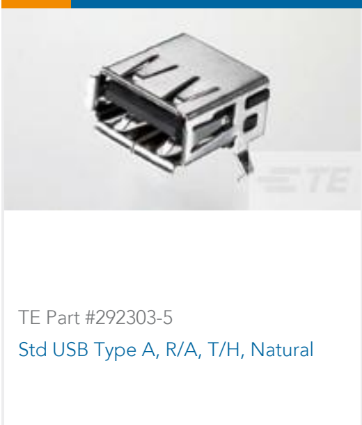
TE Part #292303-5 Std USB Type A, R/A, T/H, Natural