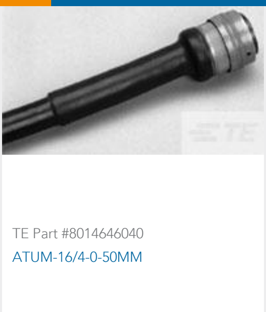
TE Part #8014646040 ATUM-16/4-0-50MM