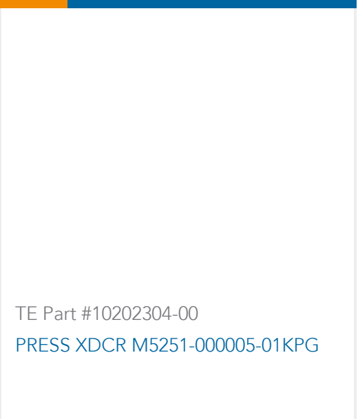
TE Part #10202304-00 PRESS XDCR M5251-000005-01KPG