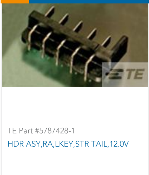
TE Part #5787428-1 HDR ASY,RA,LKEY,STR TAIL,12.0V