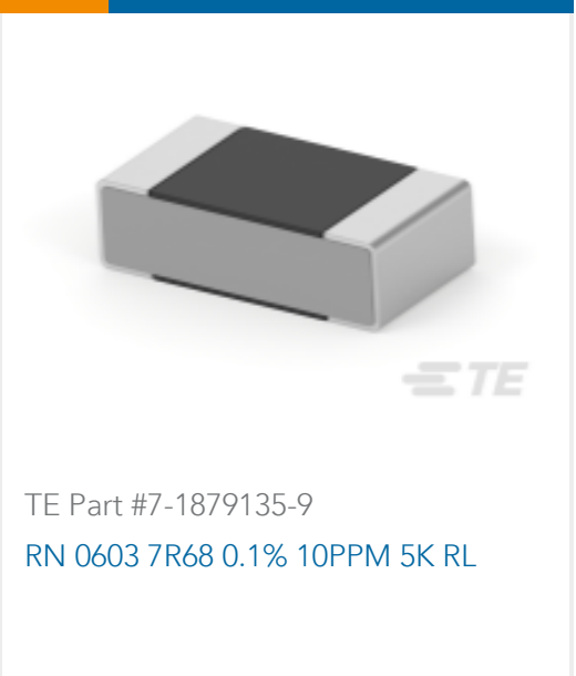
TE Part #7-1879135-9 RN 0603 7R68 0.1% 10PPM 5K RL