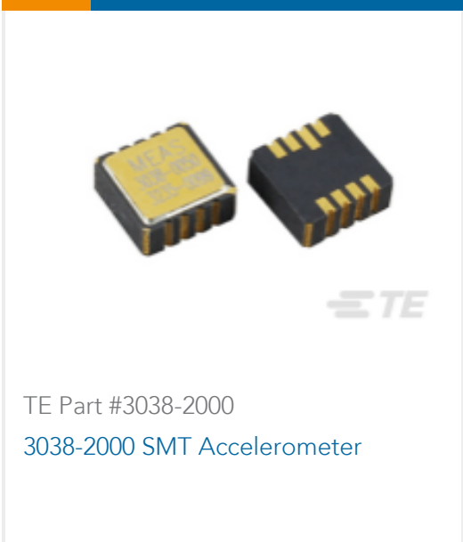
TE Part #3038-2000 3038-2000 SMT Accelerometer