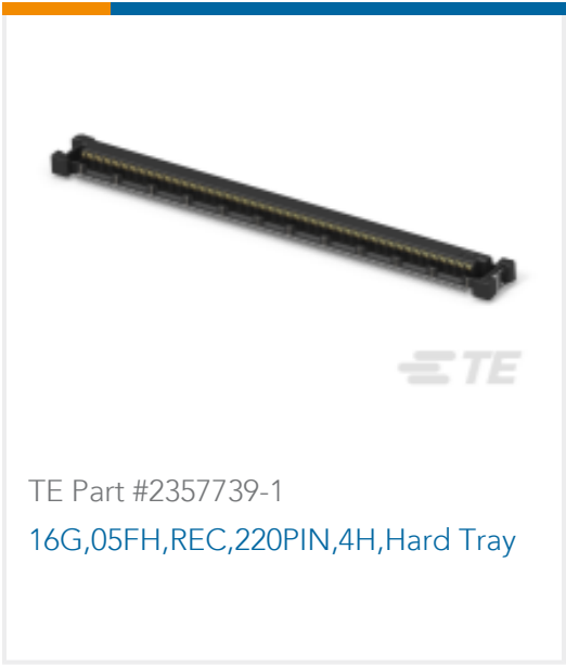
TE Part #2357739-1 16G,05FH,REC,220PIN,4H,Hard Tray