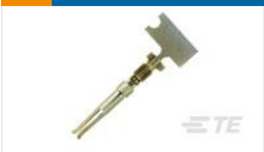
TE Part #1658537-3 SOCKET CONT DUPL PLT STRIP HD-