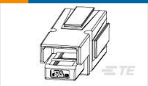
TE Part #1445957-5 HSG SUB ASY,RED