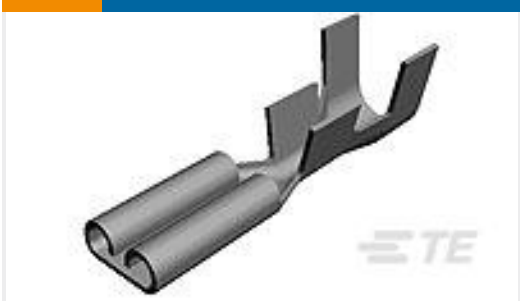
TE Part #160484-4 110 FASTON,REC.,20-17 AWG,BR