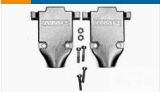
TE Part #1-5745172-3 AMPLI CBL CLMP KIT