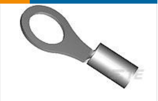
TE Part #31112 BUDGET RING 12-10 6