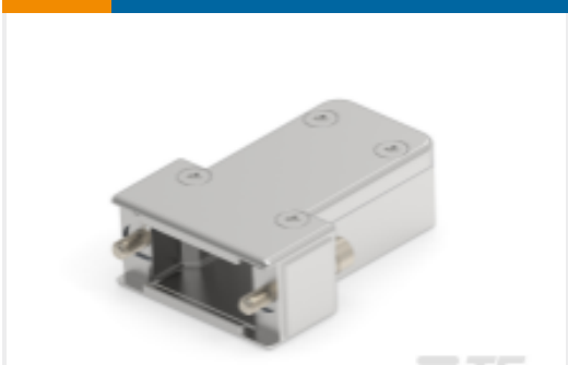
TE Part #1-2308340-1 FULL METAL HOODS SIZE 1