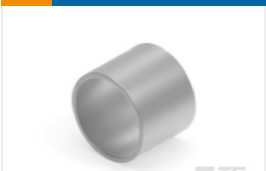
TE Part #1-2308350-7 CRIMP BARREL7