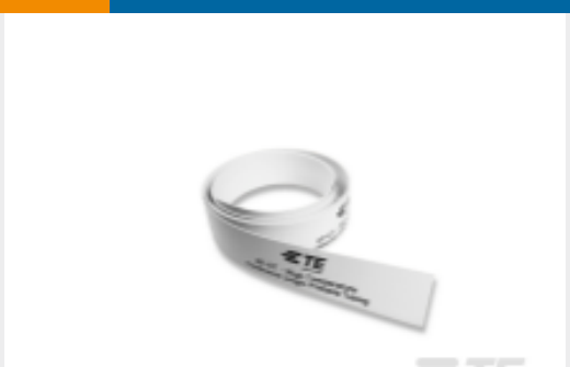
TE Part #EL7358-000 Continuous Tube High Temperature HT-CT