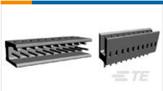
TE Part #826467-4 4P MOD II SHROUDED HEADER, ST