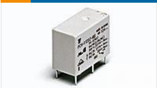
TE Part #1461353-5 PCH-112L2MH,000