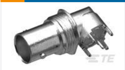
TE Part #5415025-2 JACK, RTANG, PCB, 50 OHM, BNC