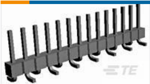
TE Part #1241150-5 5P MOD II BREAK AWAY HDR , SMD, BLISTER