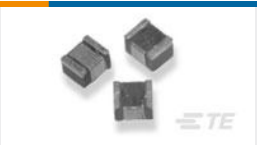
TE Part #5-1624112-2 3650 0402 33nH 5% 2K RL