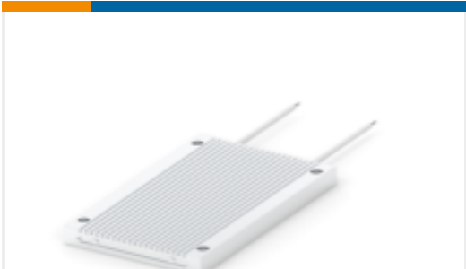
TE Part #2176249-8 TJT 300W 15R 5%