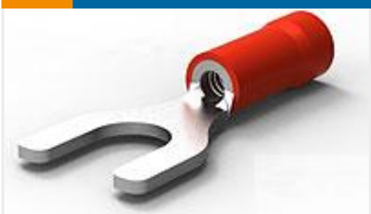
TE Part #34156 PG SPD 22-16 COMM 22-18 MIL 10