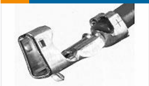
TE Part #353907-1 CT 1.5MM REC CONT CRIMP TYPE