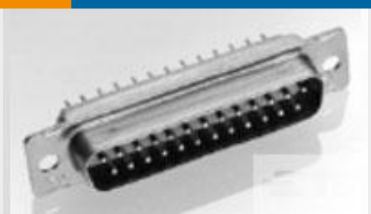
TE Part #1757820-8 AMPLIMITE,ASY,RCPT,STD,109,ZN,3, CT