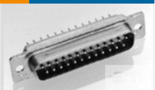
TE Part #1757819-6 AMPLIMITE,ASY,PLUG,STD,109,ZN,1, CT