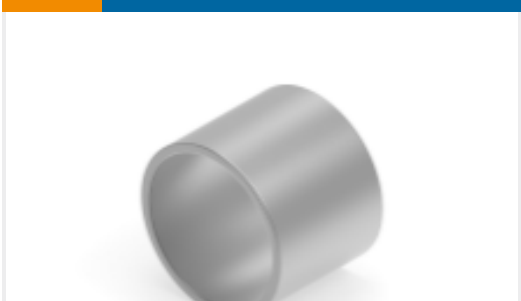
TE Part #1-2308350-7 CRIMP BARREL7