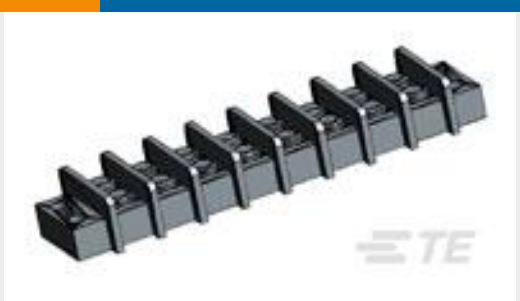
TE Part #1546670-8 8P .437" DR BARRIER,W/BND SCRW