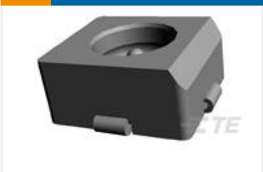
TE Part #1055688-1 2367 5001 54, VERT PLUG