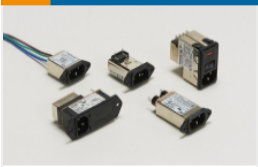
Multi-Function Inlet Filters(3)