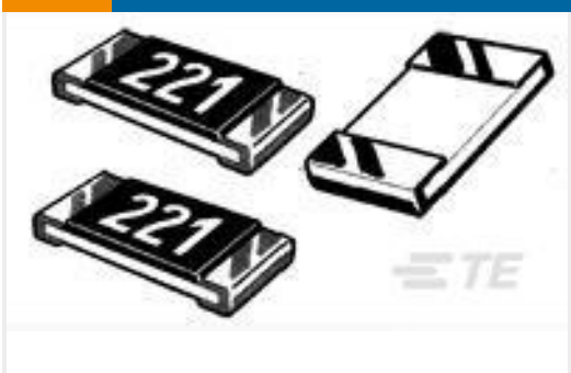
TE Part #5-2176070-5 3521 1K8 1% 2W