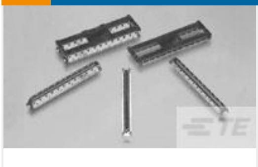
TE Part #3-1939756-6 .5FHP08H,220,S,GIG,30/Sn,HT,NS