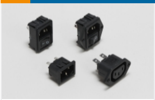
IEC Unfiltered Inlets(7)