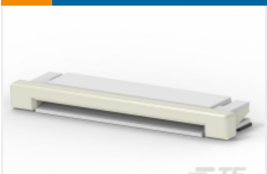
TE Part #1734592-6 0.5mm FPC Connectors