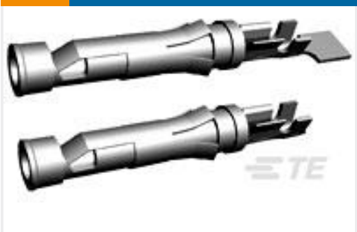
TE Part #66360-4 SOCKET ASSEMBLY, LOOSE PIECE, TYPE III+