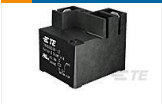
TE Part #5-1419102-2 T9AP5D52-24