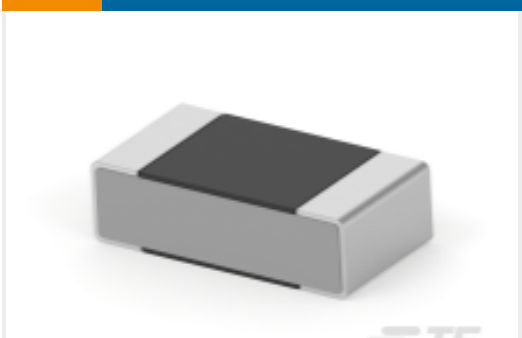
TE Part #6-1879207-3 RN 0603 442K 0.1% 10PPM 5K RL